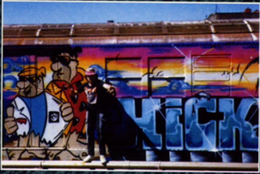
Part of a "HICKEY SKI" Whole Car by SEEN / UA (1984)