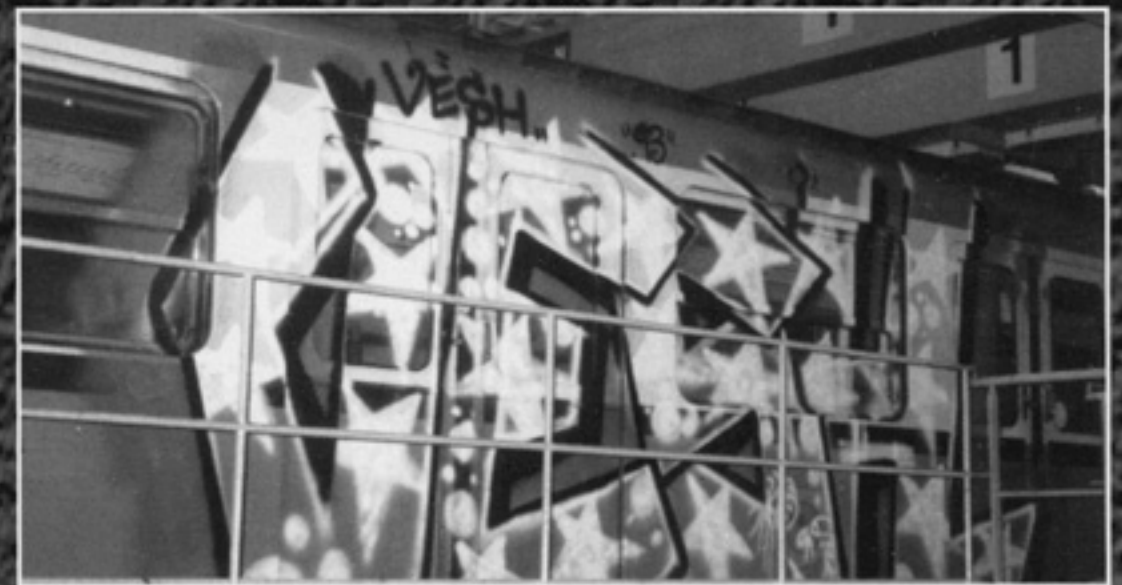
T2B by VESH / MCS (Subway, PARIS - 1993)