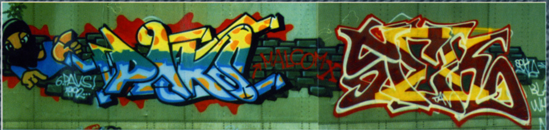
XPAKS / CMD • SEK 24 / TAV (1992)