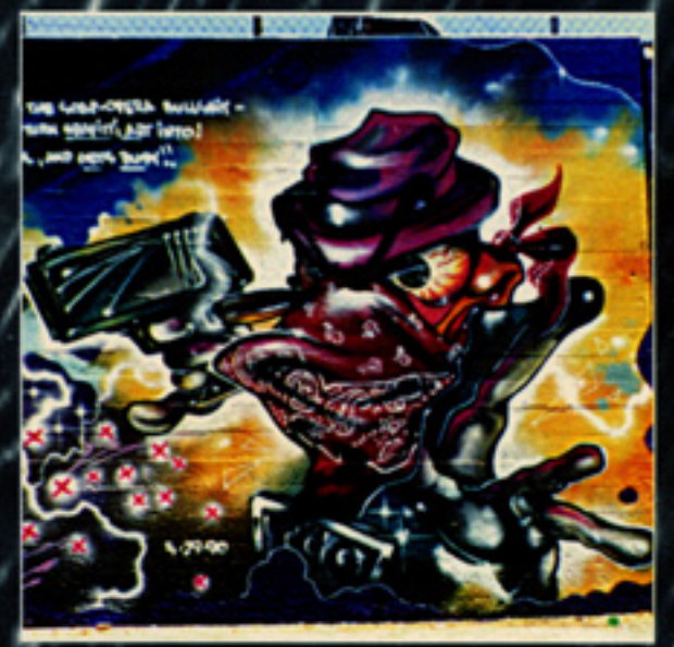
HEX / TGO (LOS ANGELES, USA - 1990)