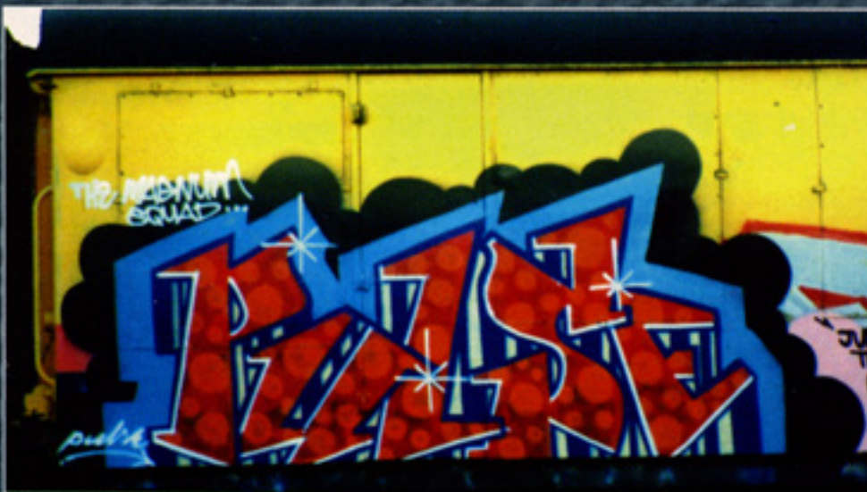
PULSE / TMS - ILC (Freight Train, NOTTINGHAM - 1991)