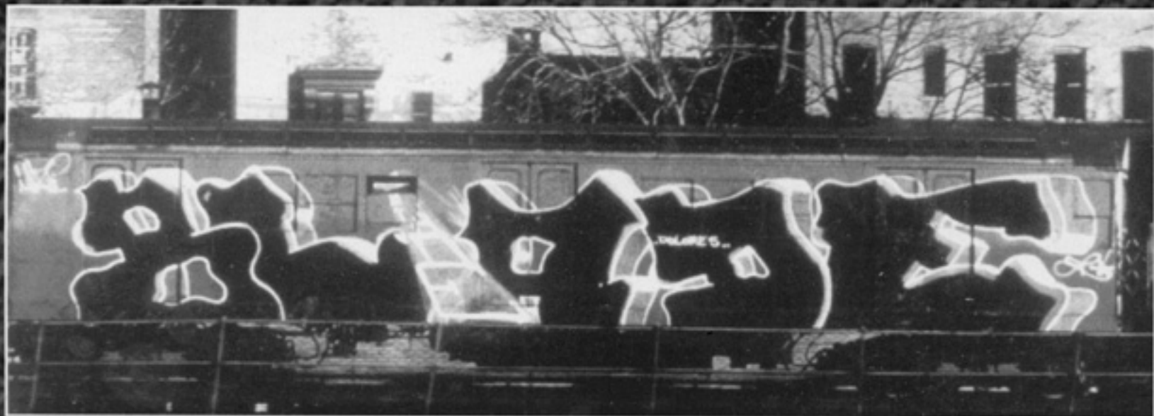
Whole Car by BLADE (Subway)