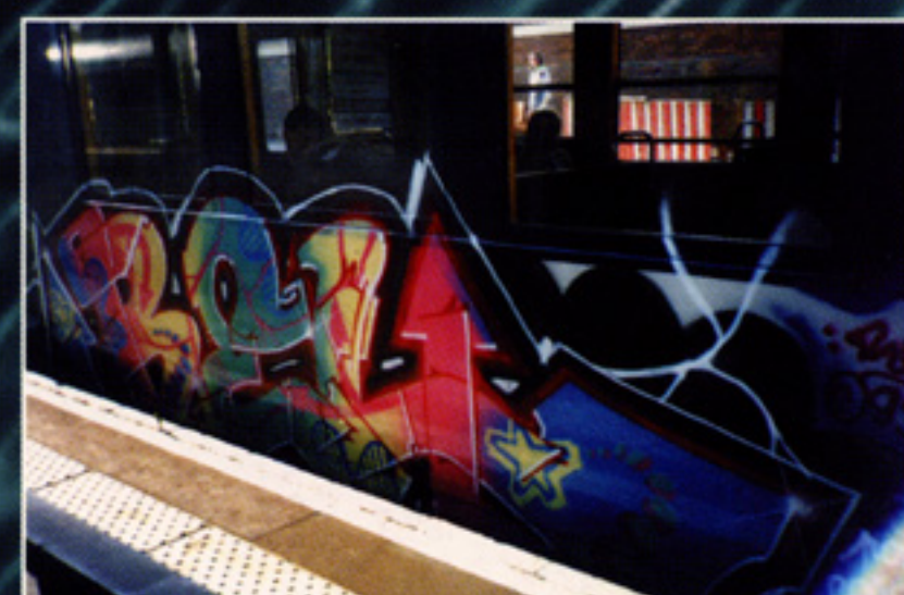
REL / DKA - ACR - TCP (RER A-Line, PARIS - 1993)