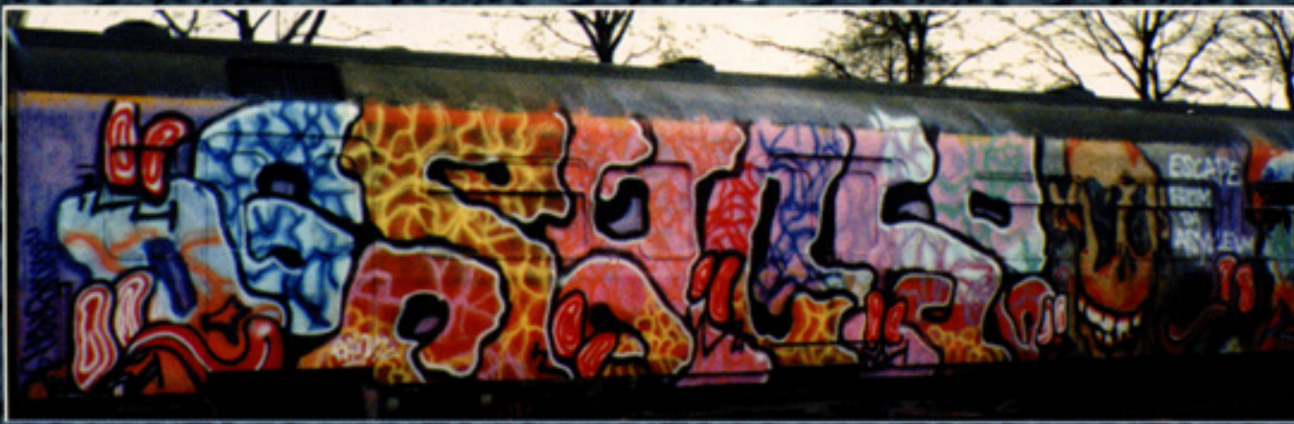
"OG SYCHO" (Escape from da asyleum ! HOLLAND - 1992)