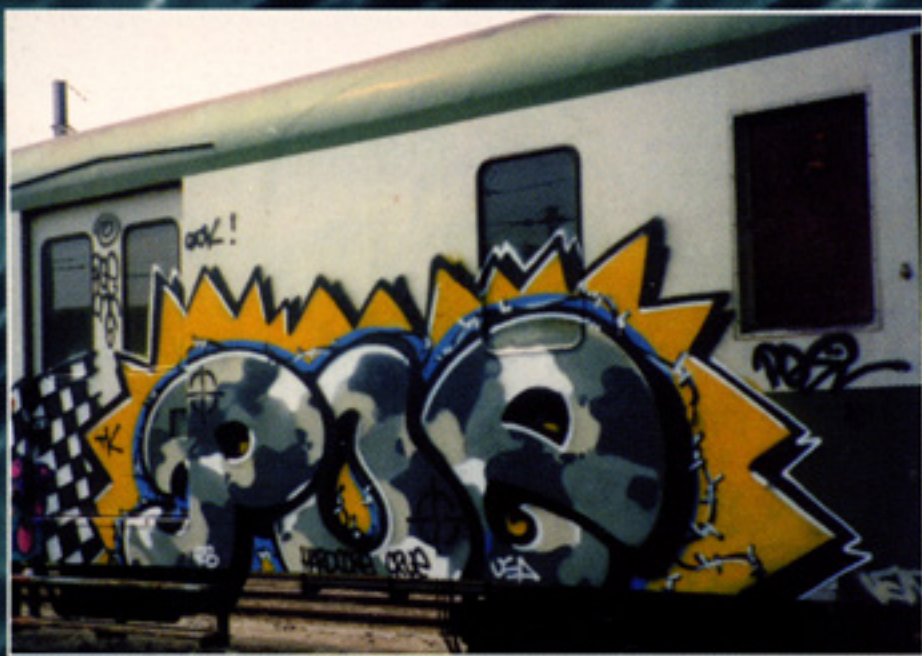
POE / SDK - HC - USA from PARIS (MONTPELLIER - 1993)