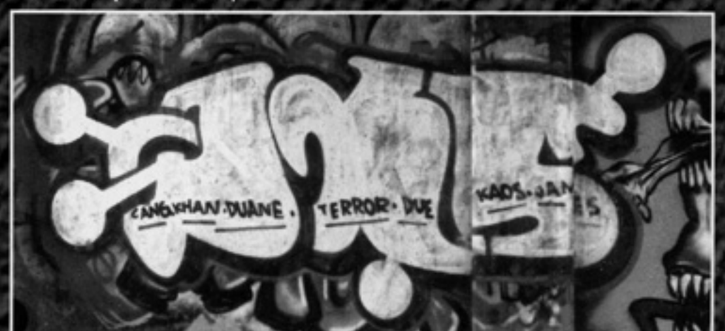
PKS / VIM (STOCKHOLM, SWEDEN - 1993)