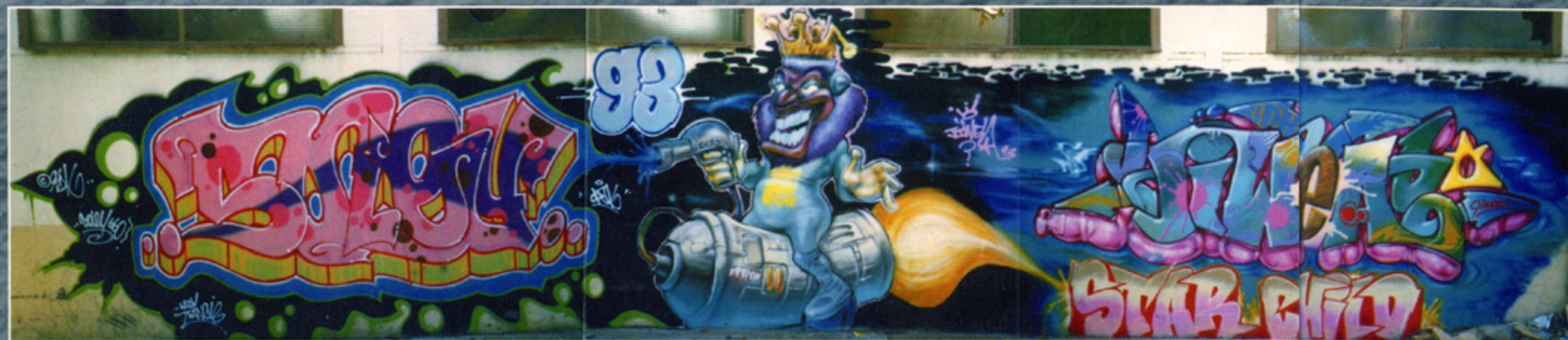
SOLEY 660 • JIWEA / SDK (PARIS - 1993)