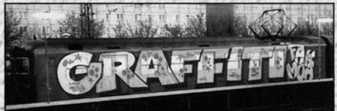
"GRAFFITI" Whole Car by FAK Crew • MOA Crew (S-Train)