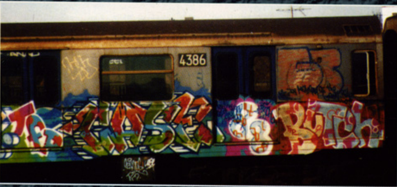
CASE • BUTCH / TFP (1988)