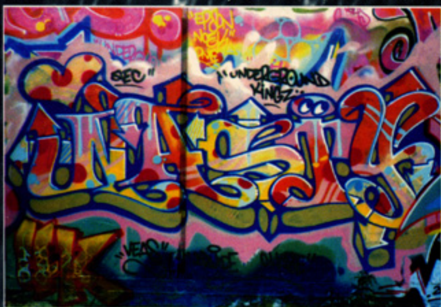
NASTY / UK - AEC (PARIS - 1993)