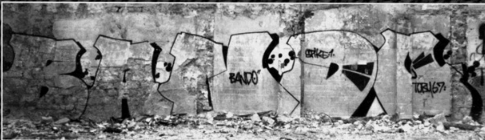
BANDO / CTK (PARIS)