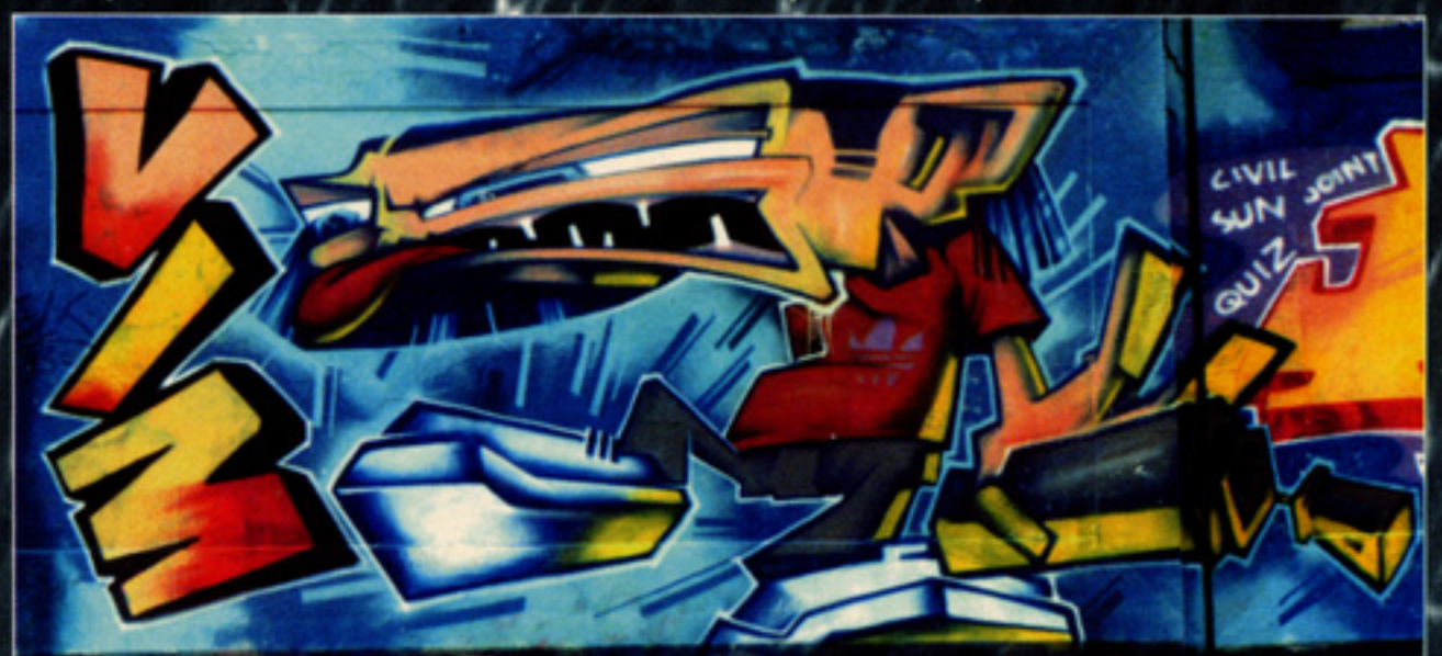
PIKE / VIM (STOCKHOLM, SWEDEN - 1993)