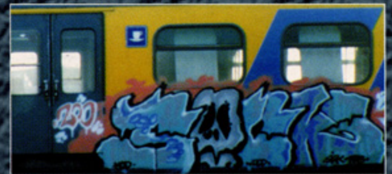
SICK (HOLLAND - 1993)