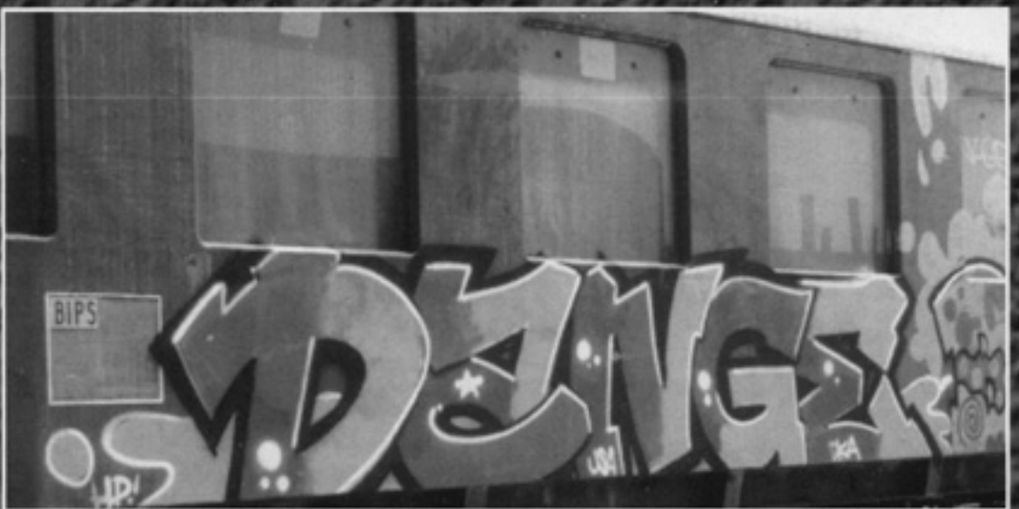
DANGE / HPC - DKA - USA (NIMES - 1993)