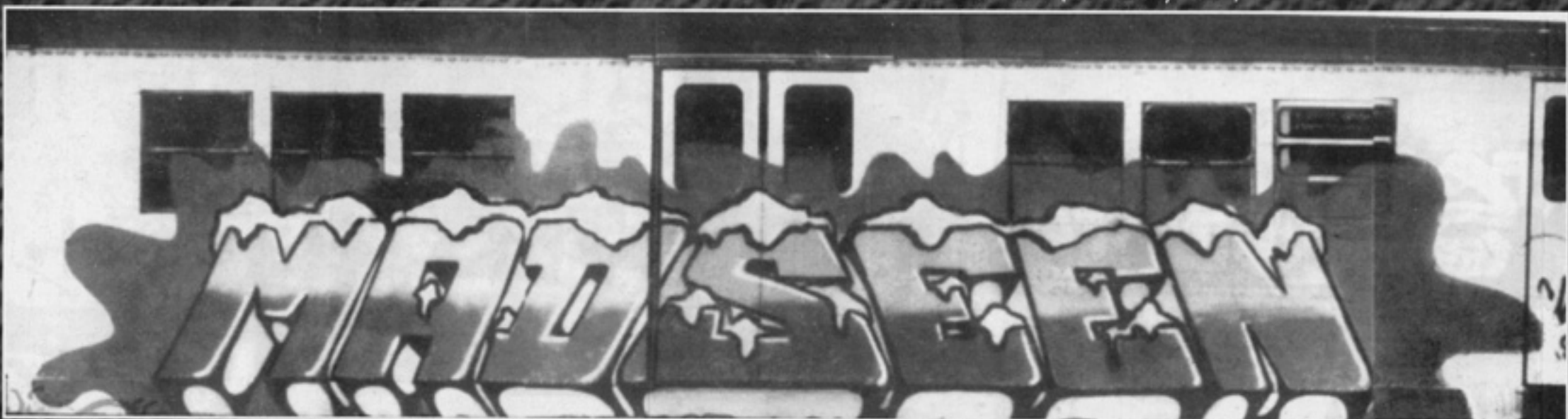
"MADSEEN" by SEEN / UA (Subway)