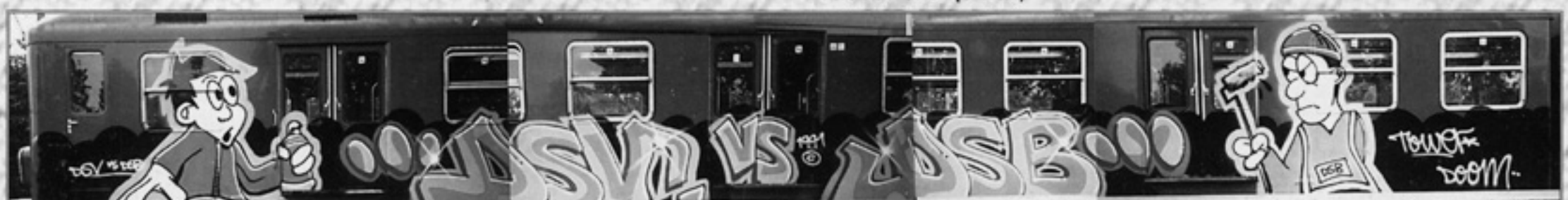
"DSV VS DSB" by TOWER • DOOM / DSV (S-Train, 1991)