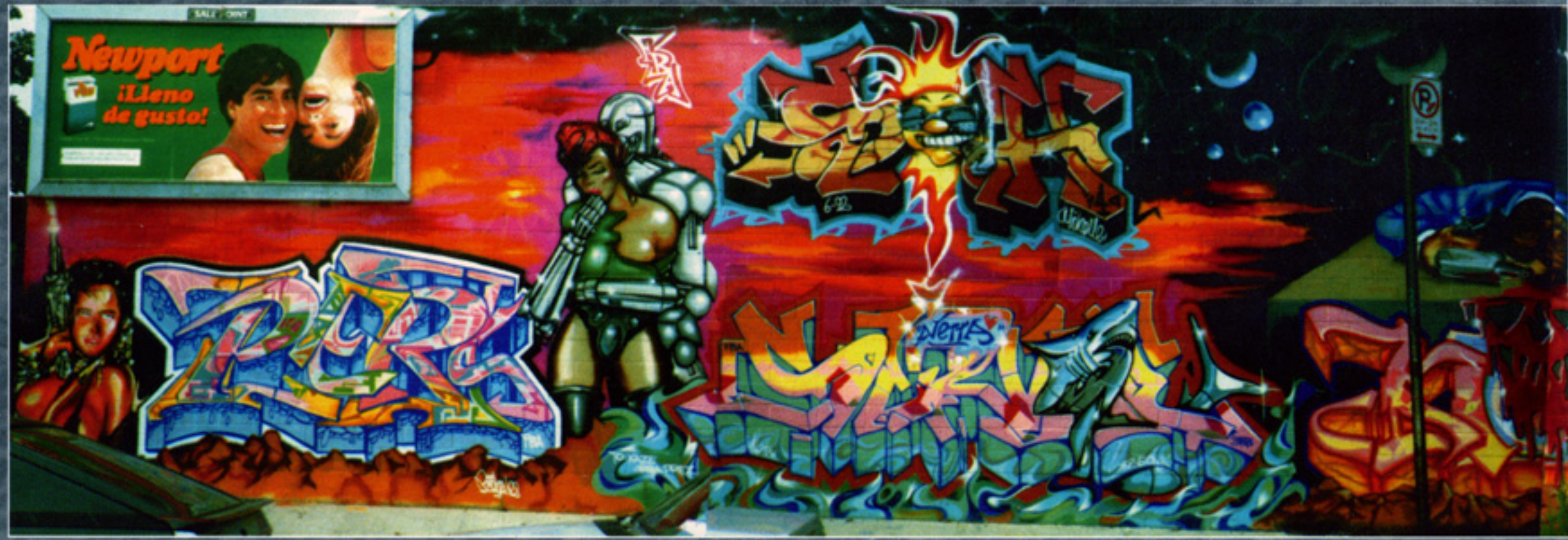
PER • SOH • SERVE • NOMAD / FBA (1992)