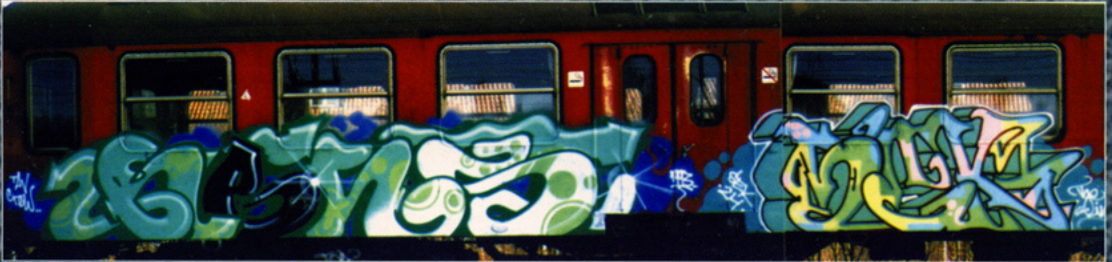
RENS • SEK 24 / TAV (1993)