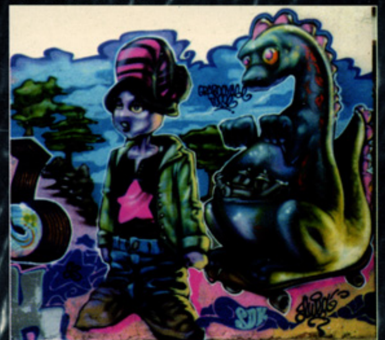
JIWEA / SDK (PARIS - 1993)