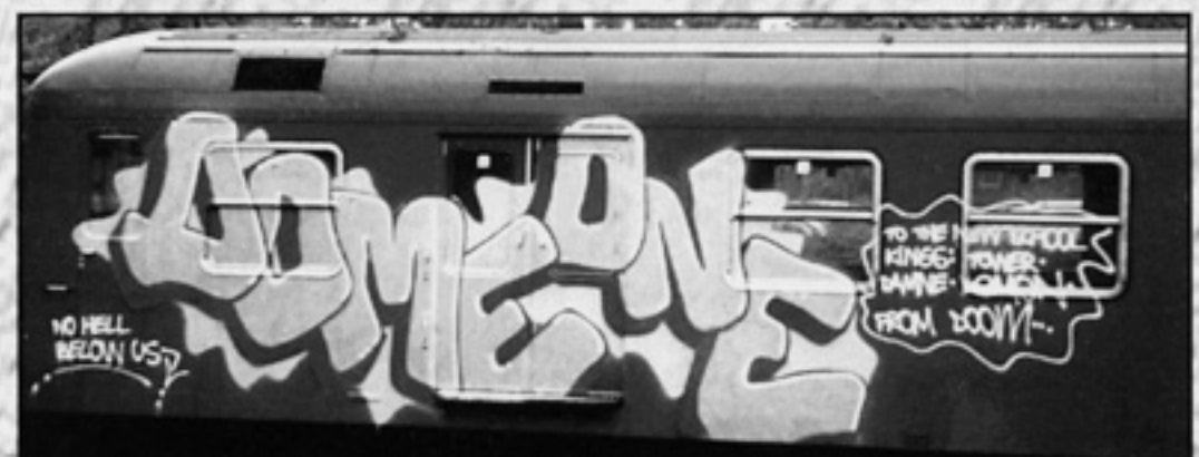
"DOME ONE" by DOOM (S-Train)