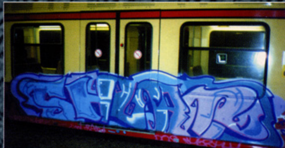
SHORT (BERLIN S-Train, GERMANY - 1993)