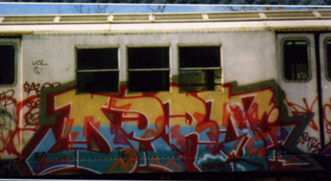
DERO / FC - TFA - TCS (1988)