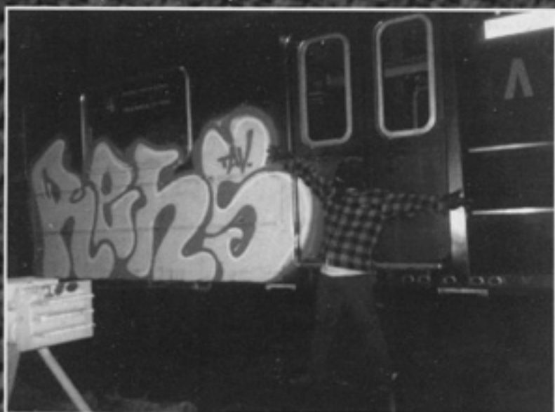
RENS / TAV from COPENHAGEN (Clean Subway - 1993)