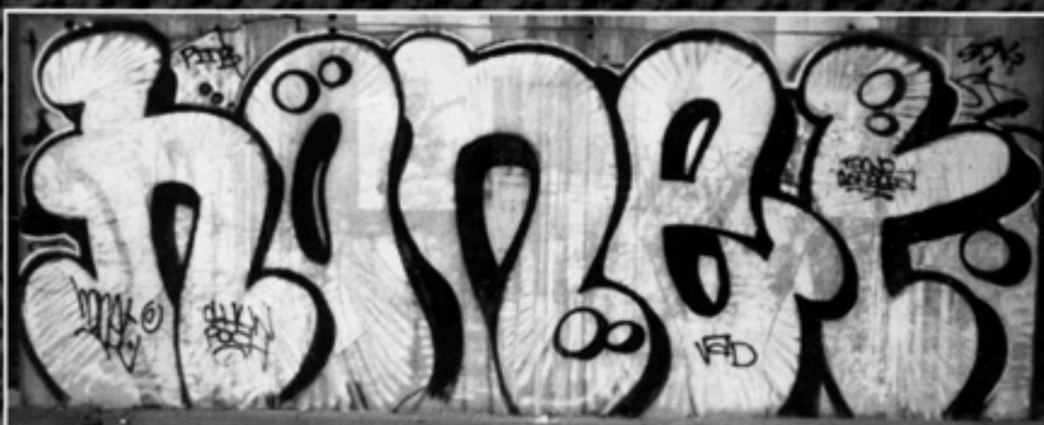
HONET / SDK - P2B - VAD (PARIS - 1993)