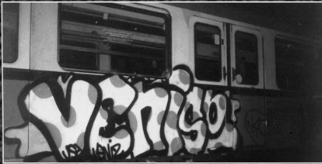
VENISE / USA (Subway, PARIS - 1993)