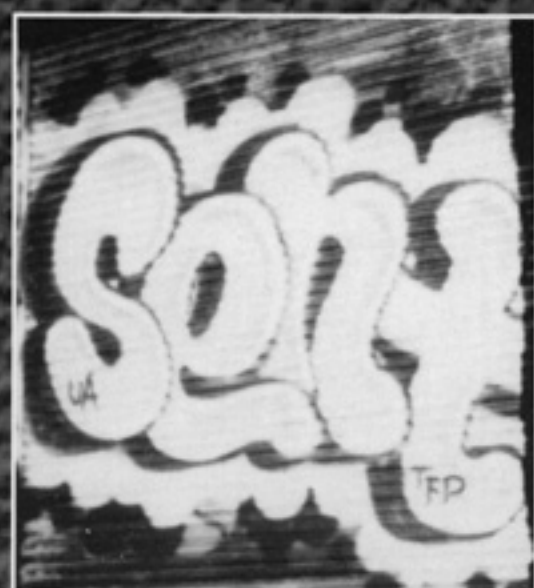
SENT / UA - TFP