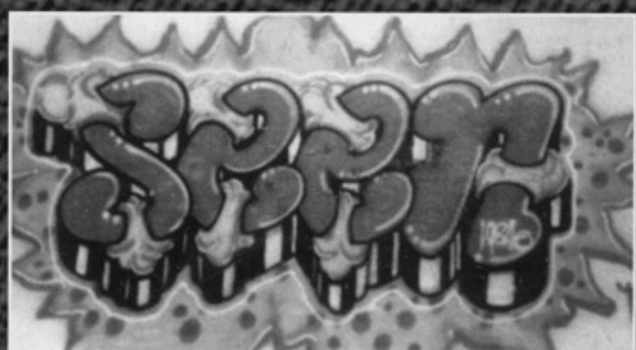
SEEN / UA (1984)