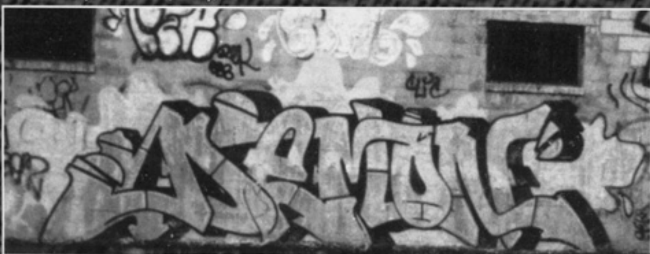
DEMON by SEEN / UA