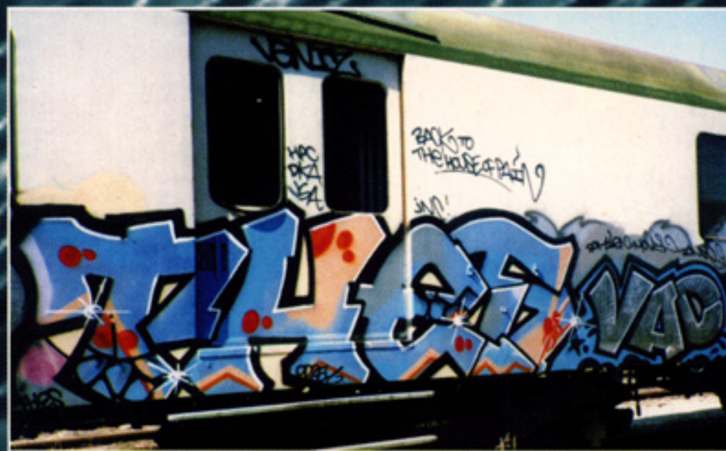
THES / VAD - USA - HPC - DKA from PARIS (MONTPELLIER - 1993)