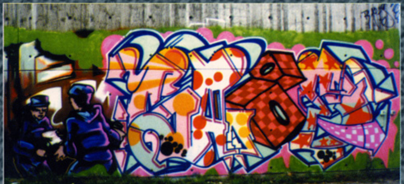
SABE / GG