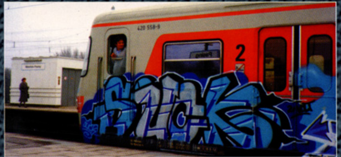
SUCK from ZÜRICH (MUNICH S-Train, GERMANY - 1993)