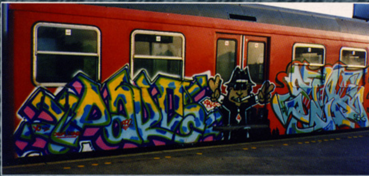
XPAKS / CMD • SEK 24 / TAV (S-Train - 1992)