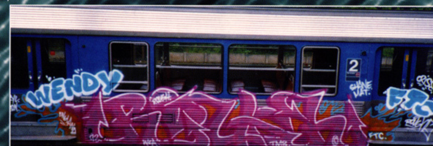
ROUGH / FTC from LONDON (St Lazare Line, PARIS - 1993)