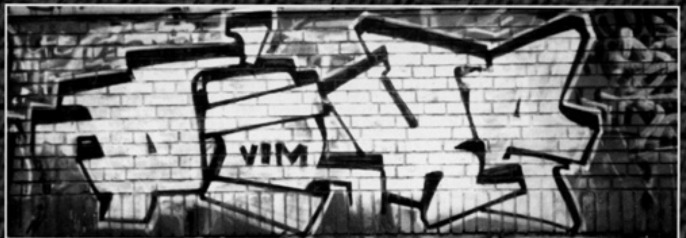
PIKE / VIM from STOCKHOLM (COPENHAGEN, DENMARK - 1992)