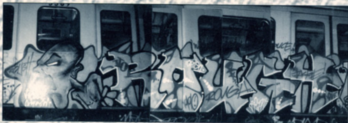
ROUGH / VOP (London Subway, 1990)

•1990/1993 : 1990 saw a drastic change in London's style due largely to the new found in-flux of work from L.A., Paris, Germany, Holland, Denmark, Australia, etc... London died soon after this period leaving an even smaller bunch of writers such as Sek, Mear, Rough, Elk, Dreph, Seize, Stet, Shuto, Noise, Prime occasionally coming out of the woodwork to paint. Trains are still being painted but not like in the old days.