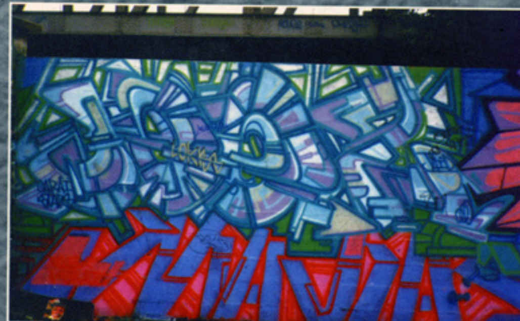
"JEEZ" by LOKISS (PARIS)