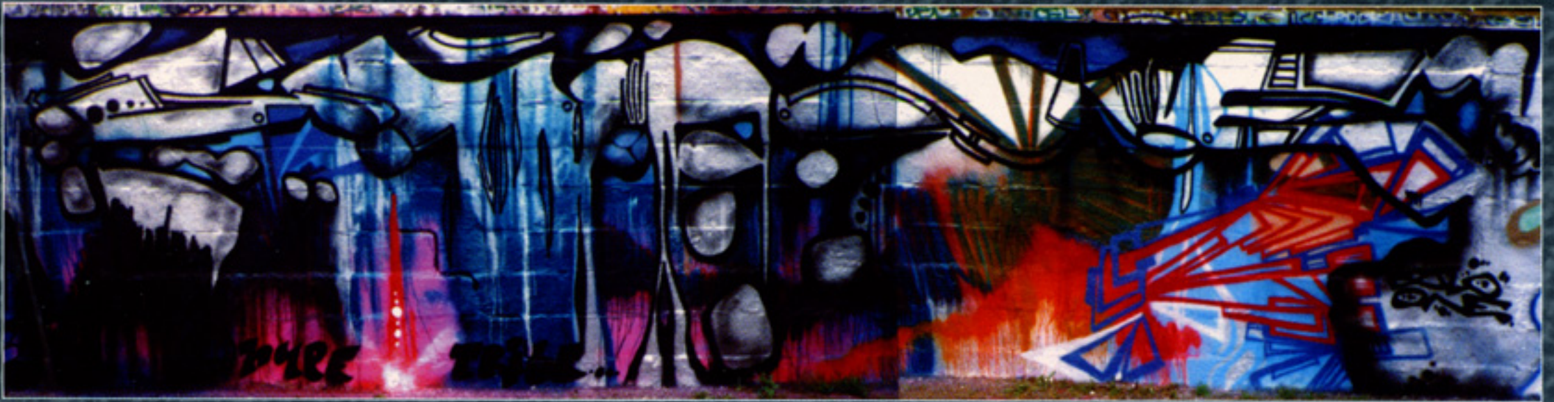
SOLO ONE / VOP (LONDON - 1991)