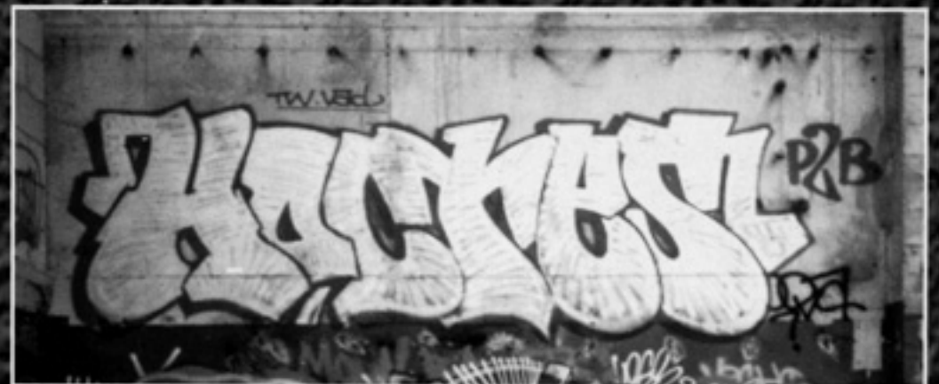
HOCTES / P2B - TW - VAD (PARIS - 1993)