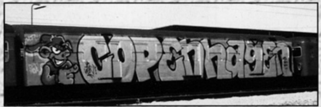
"COPENHAGEN" Whole Car by MOA Crew (S-Train)