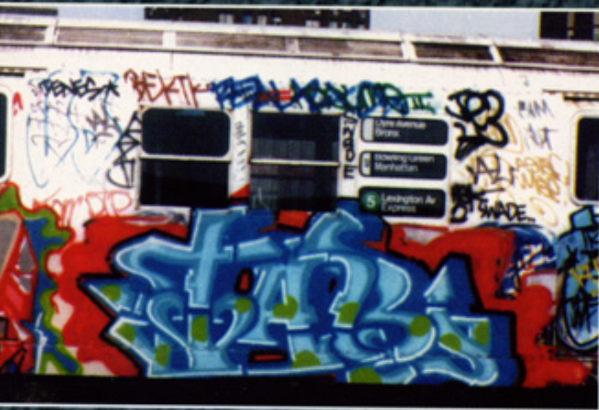
"TAB" by DERO