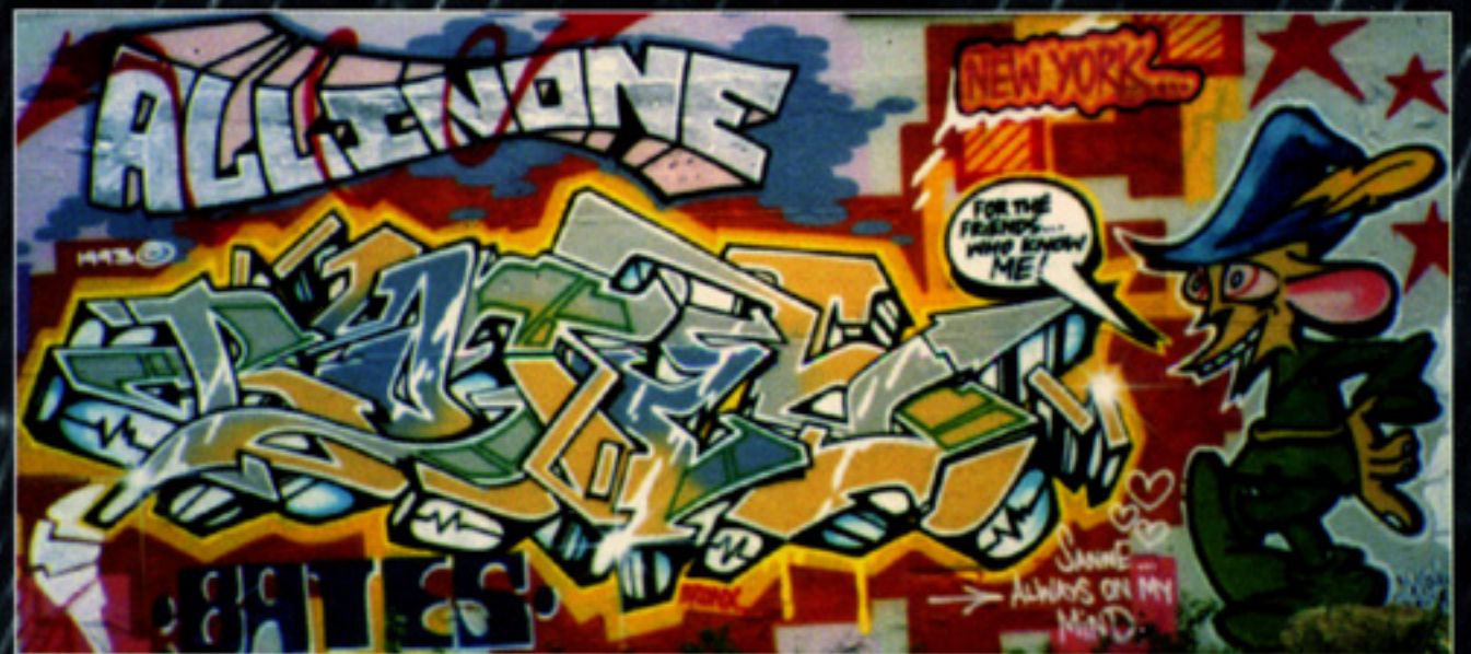
BATES / AIO from COPENHAGEN (SOUTH BRONX, NEW YORK - 1993)