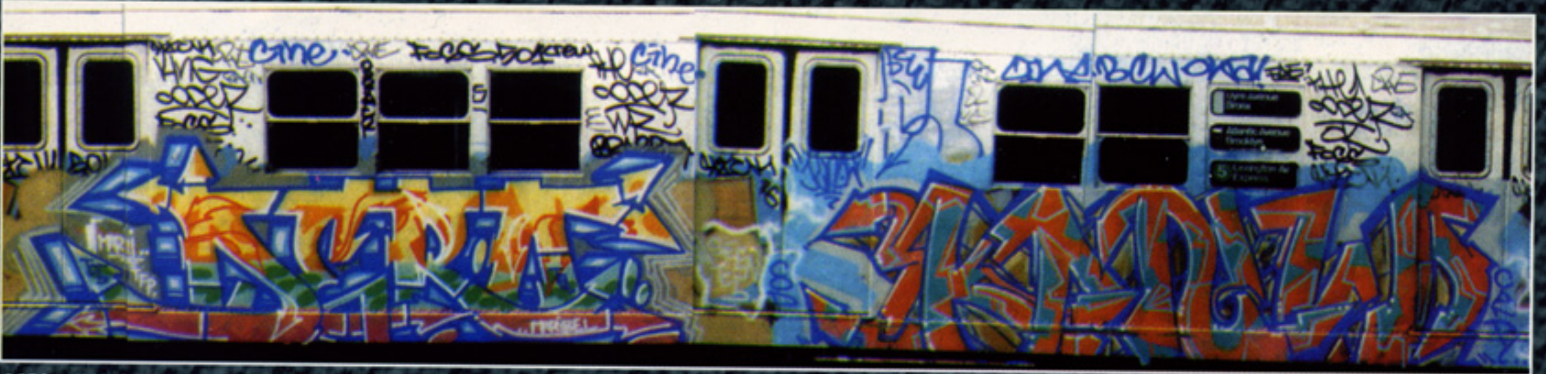
DERO • KNOW / FC - COD - TCS (1987)