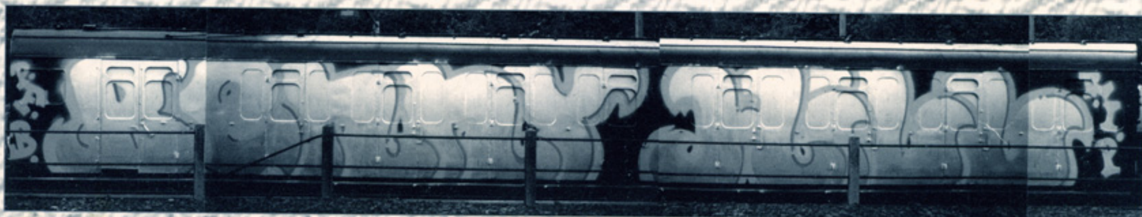
"BENNY HILL R.I.P." by the PFB Crew (1992)

At this point it's time to move out of London to Brighton, where a strong little scene flourishes, held by She, Req, Fire and Kerb. Then over to Maidstone where Facs and Spike drop the best burners. Windsor is controlled by the "supernaturals" Dref, Skuba and Koze. The Midlands is a different history altogether; what with Brim and Bio-TAT from NY going to Birmingham in 1985, the styles there took their own course. Midcity Artists, The Wild Criminals and Atomic Productions got busy all over Birmingham until around 1988, then Juice 126, Cryse-FTC and the whole scene got centred around the outdoor "Blueprint Gallery". Solo One takes after his name in the Leicester area, being the only writer in the whole place, terrorising the neighbourhood with a hardcore mentality! ILC Crew (In Living Colours) rocks Nottingham non stop, with Pulse, Alert, Shok 1 and Craze all at the wheel. Stormboy from Australia and System are without doubt the only decent painters in Wales. York is home to the one and only Part 2 whose photo realist paintings have become pretty well known throughout the world. Manchester plans host to Karl and Tempt, definately on the ball. And last but by no means least Derm, Pois, Onemor and Mace of the Fallen Angelz rip the shit seriously up in Scotland's city of Edinburgh. ■