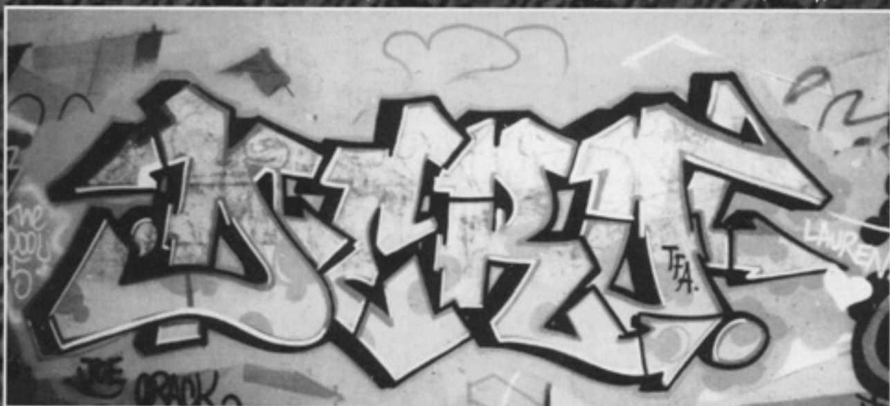
DERO / TCS - UA