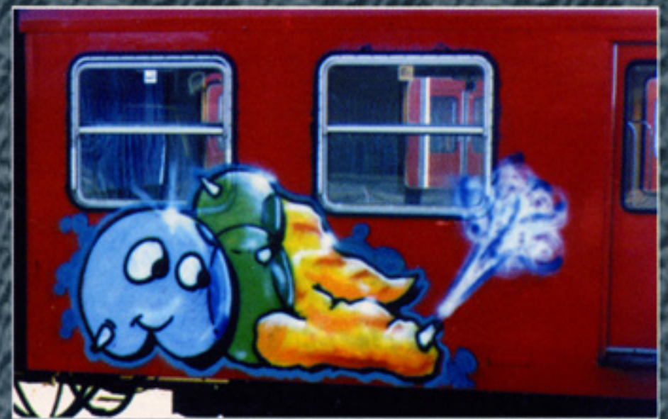
AIS Crew (1992)