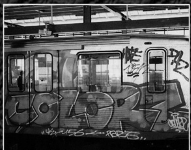
COLORZ / UK - 156 from PARIS (ADAM Subway, HOLLAND 1992)