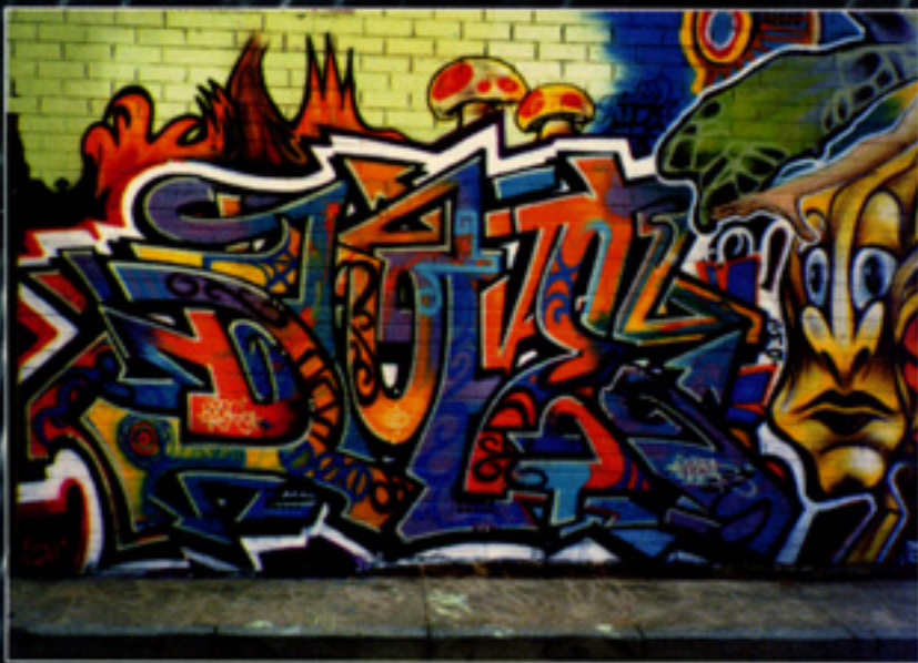
"DME" by DMOTE / DMA - TPR (AUSTRALIA)