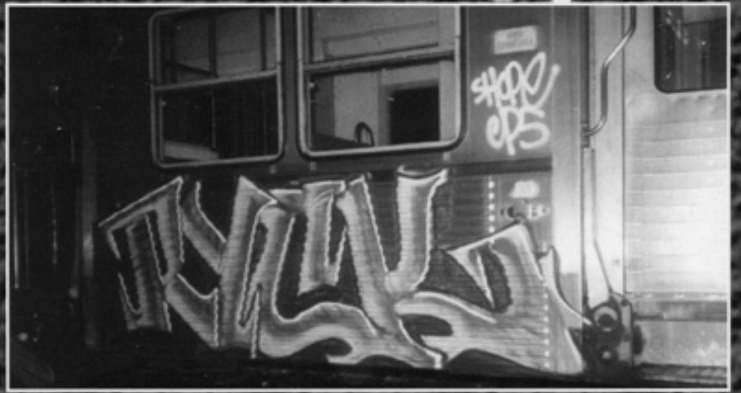
RYCK / TK - VAD (PARIS - 1993)