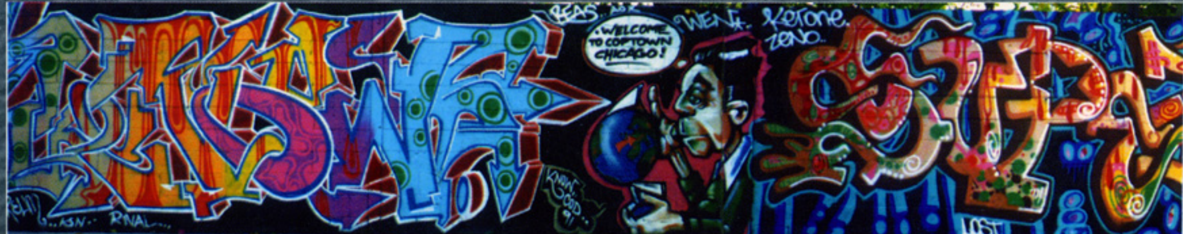
KNOW / COD • GHOST / RIS (1991)