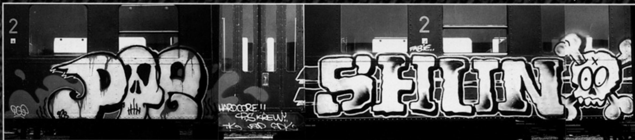
POE / SDK - TK - VAD • SHUN / CPS - TK from PARIS (BELGIUM - 1993)