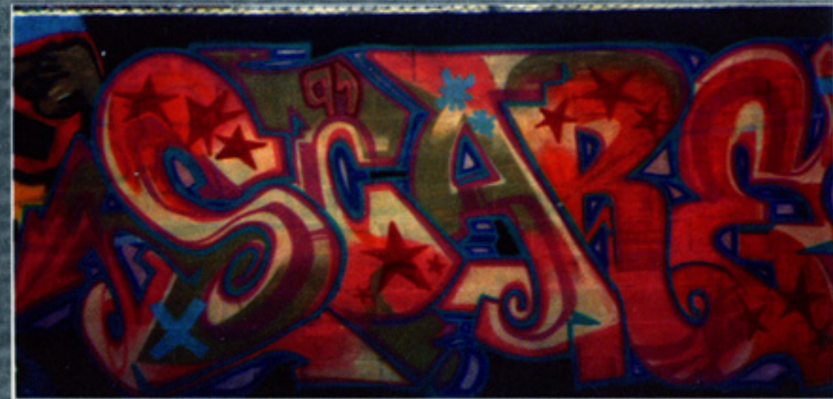
SCARE / COD • BG 183 / TAT (1991)