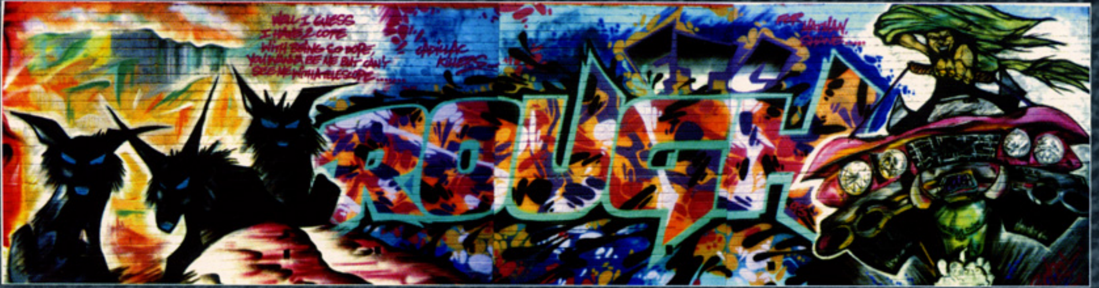
"CADILLAC KILLERS" by ROUGH / FTC (BLUEPRINT GALLERY, BIRMINGHAM - 1993)