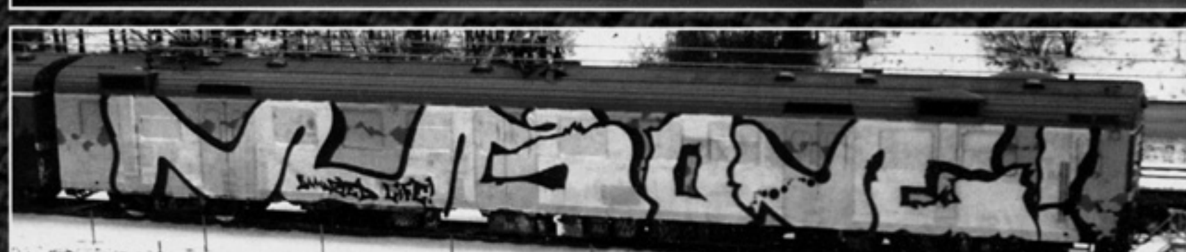
Up : MAIN/CDC from HELSINKI • CHEN/IRA from MUNICH • OPAK/SDK from PARIS • HNA/VIM. Down : NUG/VIM (STOCKHOLM, SWEDEN - 1993)