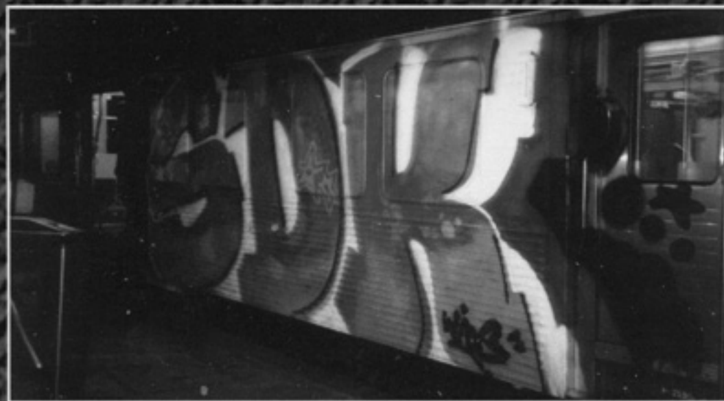
"SDK" T2B by WIDG / SDK (RER C-Line, PARIS - 1993)