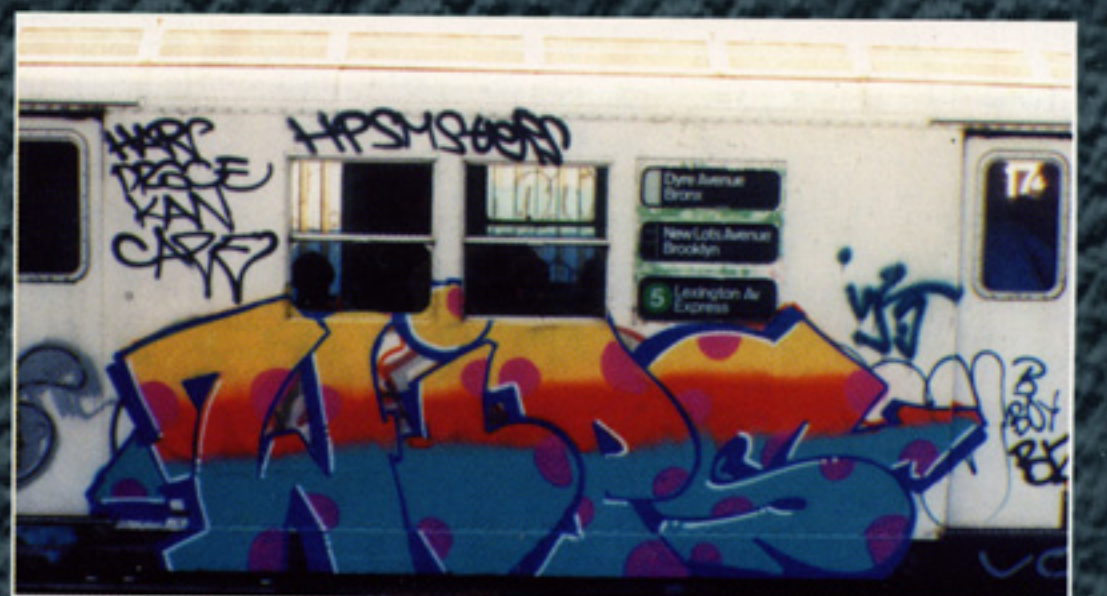
WIPS / COD