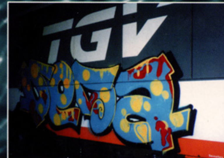
DESA / HPC (TGV high speed train, MONTPELLIER - 1993)