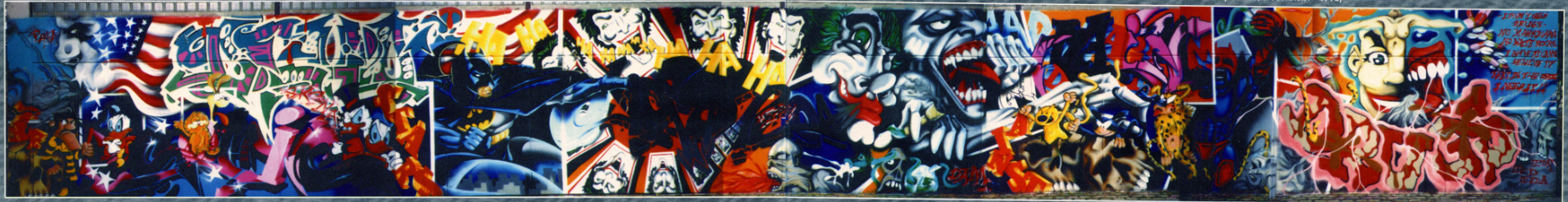
"THE COMIC STARS AGAINST DRUGS" by DEMO • SKENA • DAIM / TDS - TCD - TDA (HAMBURG, GERMANY - 1992)