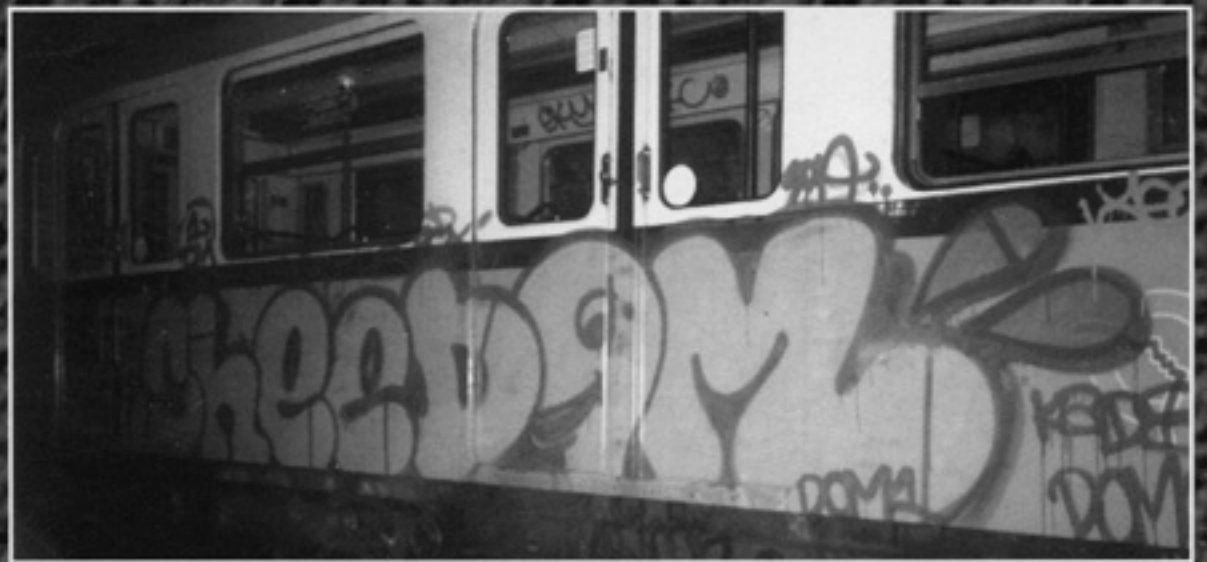
"SHEEDOM" by SHEED 16 / MKC • DOM / PCX - SDA (Subway, PARIS - 1993)