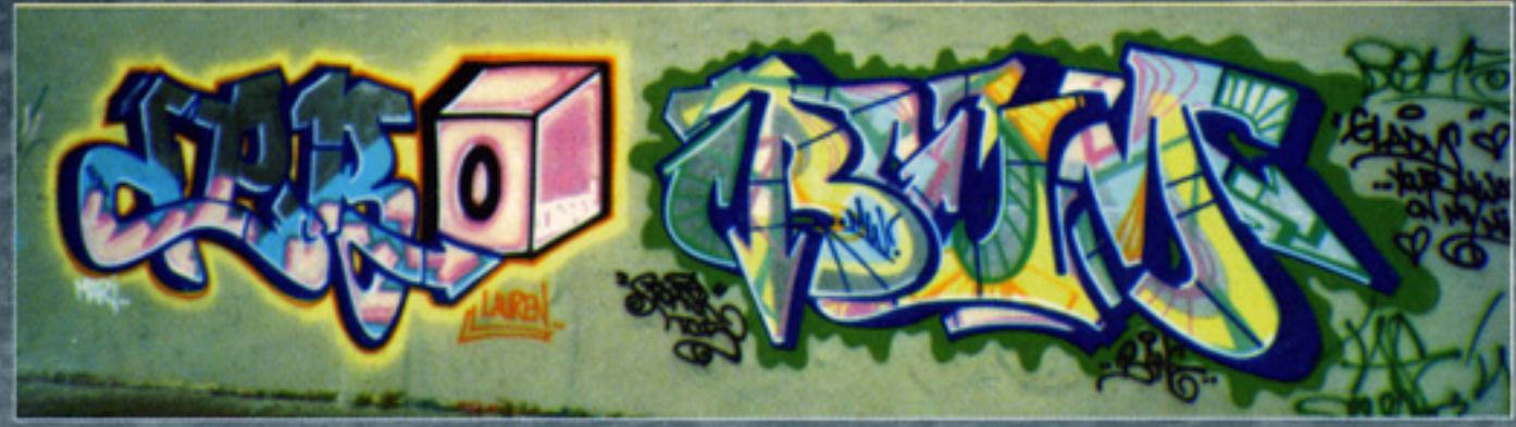
DERO • BOM 5 / MW - TCS (1993)