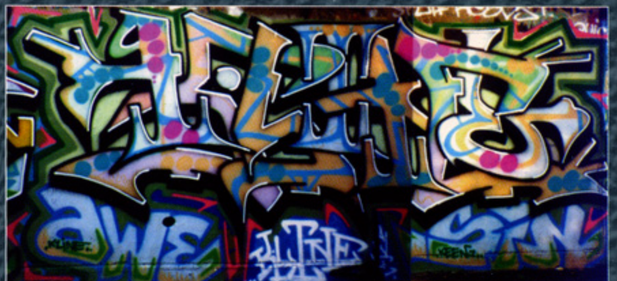
"K.LINE" by KEEN / AWE-SIN (LONDON - 1993)