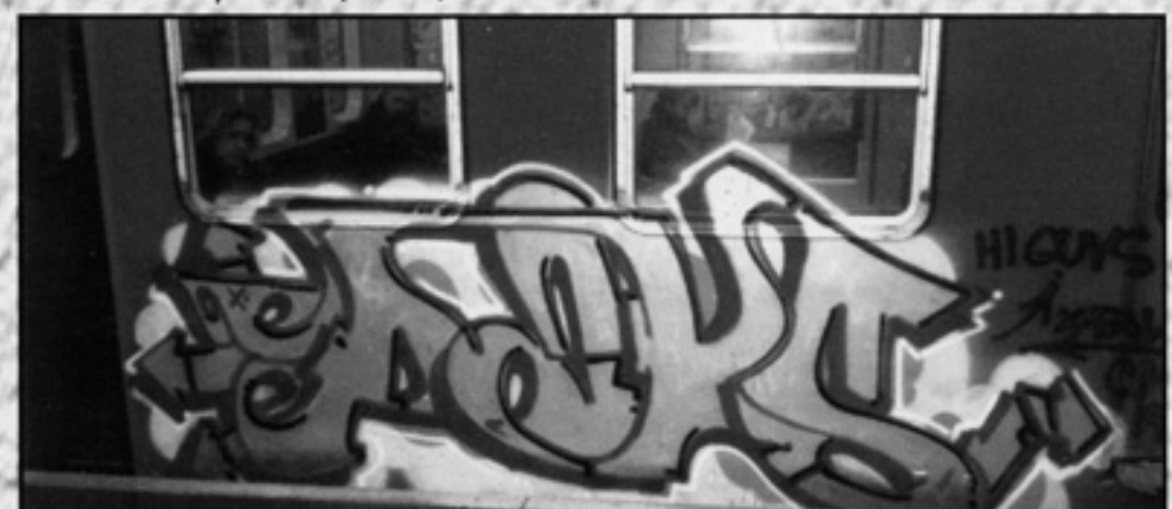
X.PAKS / CMD (S-Train)