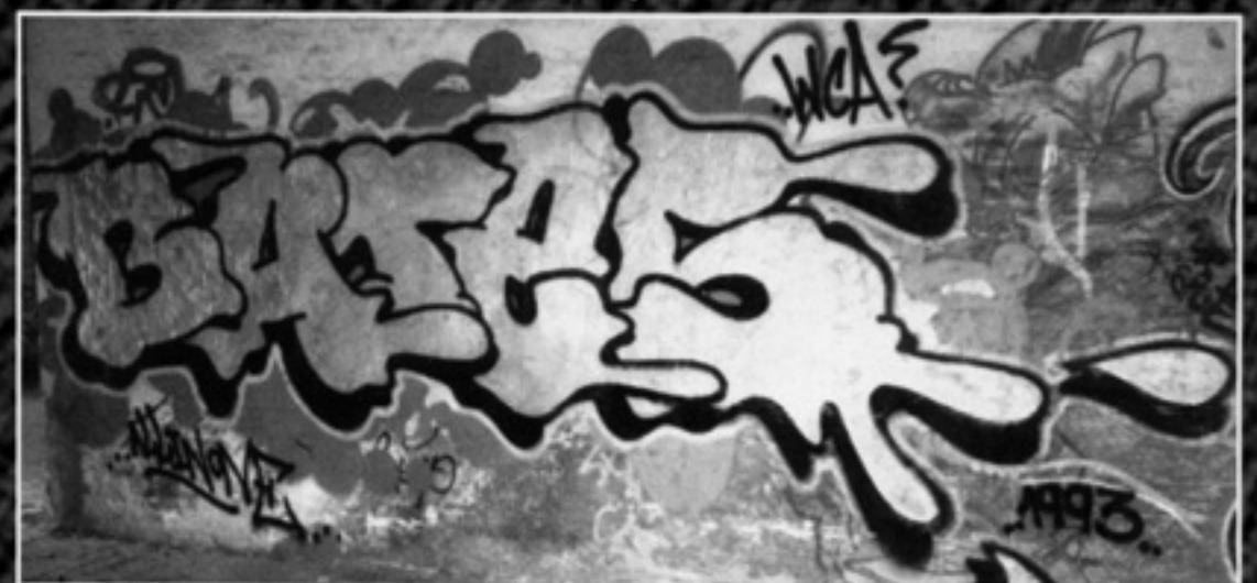
BATES / AIO - WCA (COPENHAGEN, DENMARK - 1993)