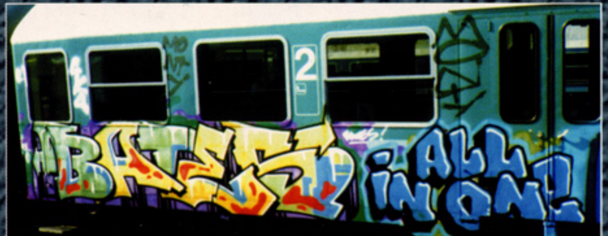
BATES / AIO from COPENHAGEN (DORTMUND, GERMANY - 1993)