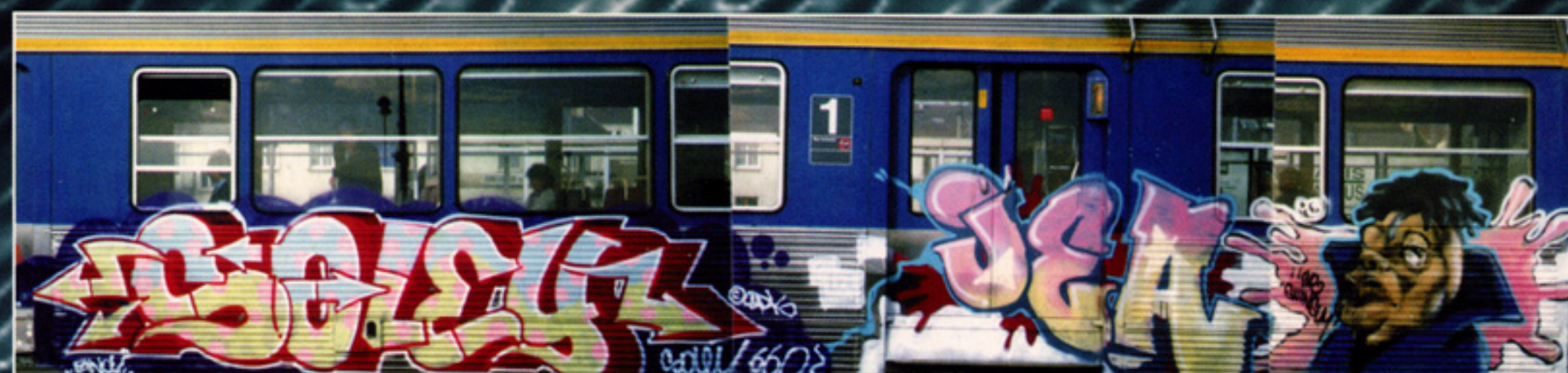
SOLEY 660 • JEN / SDK (St Lazare Line, PARIS - 1993)