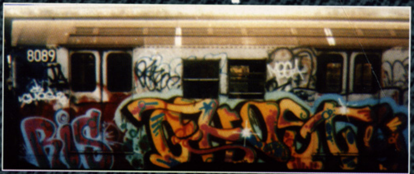
"GHOSTY" by GHOST / RIS