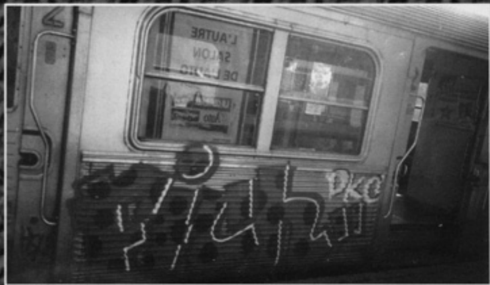
FICH / DKC (PARIS - 1992)