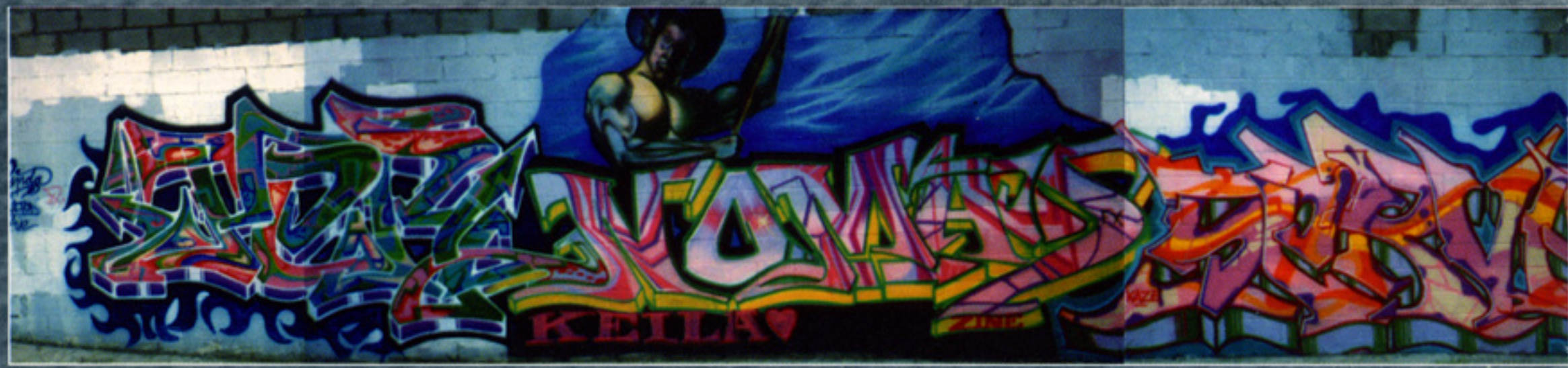
PER • NOMAD • SERVE • COPE 2 • T-KID (1993)