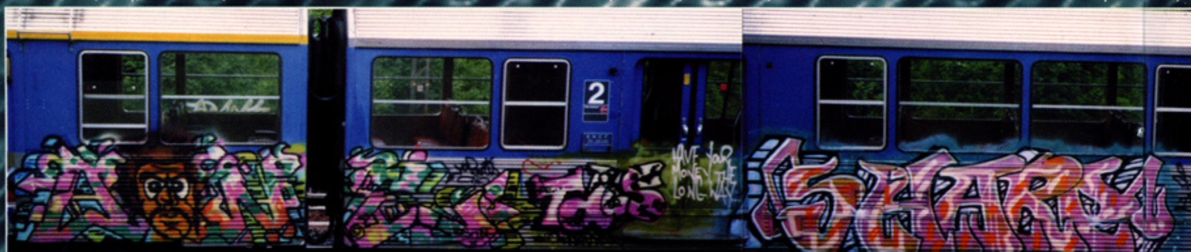
AONE / TDS and SHARP from NEW YORK (St Lazare Line, PARIS - 1993)