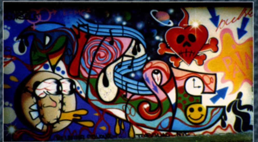
PULSE / TMS - ILC (NOTTINGHAM - 1991)