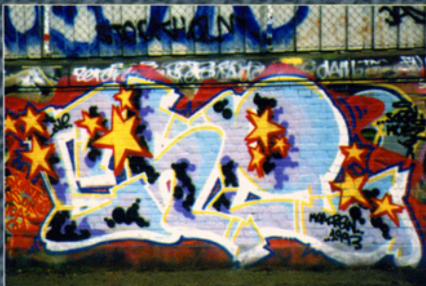
CHE / MOA (1993)