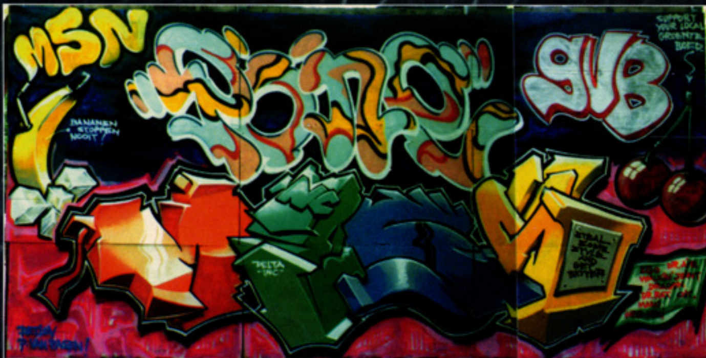
PONE / GVB - INC - MSN • "MESS" by DELTA / INC (AMSTERDAM, HOLLAND - 1993)