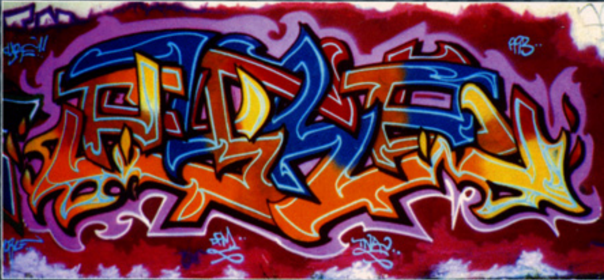
FYRE / DFM - TNA (BRIGHTON - 1993)