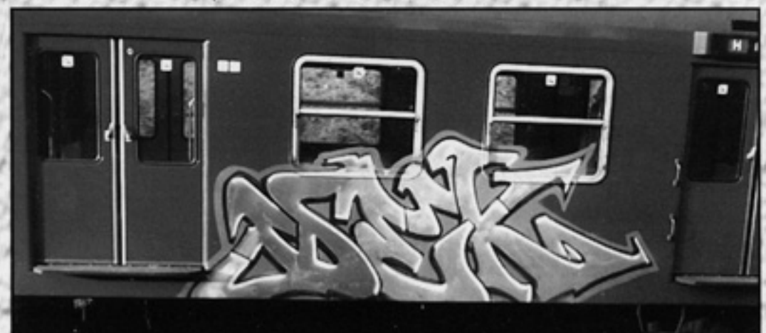
SEK 24 / TAV (S-Train)