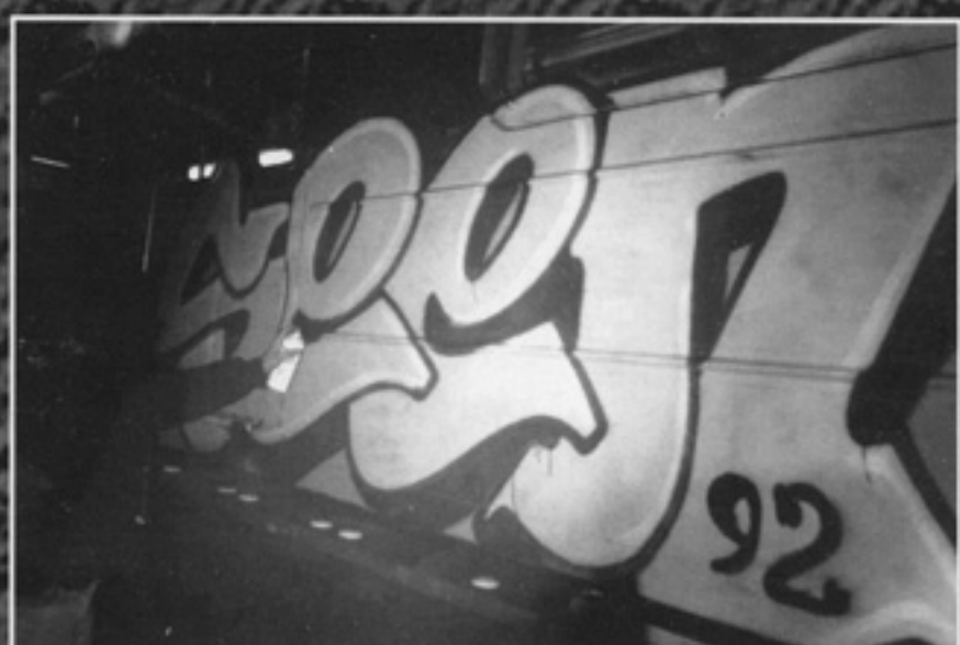
SEEN / UA (Clean Subway - 1992)