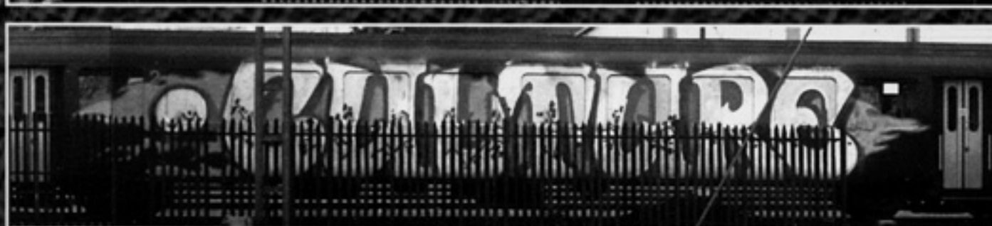
"UNKNOWN CULTURE" double whole car by... some unknown artists! (SWITZERLAND - 1993)