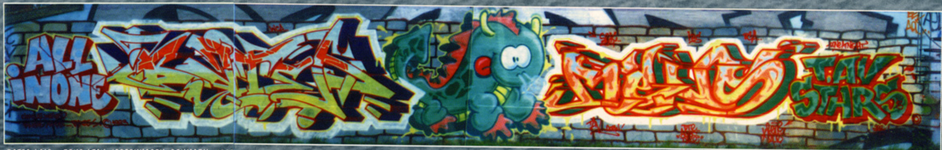
BATES / AIO • RENS / TAV (COPENHAGEN, DENMARK - 1993)