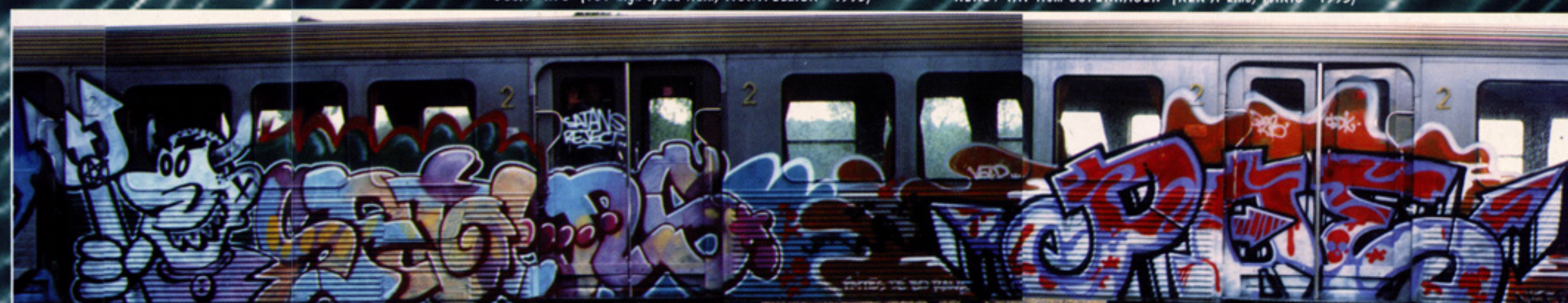
SATANS / CPS • POE / SDK - P2B (PARIS - 1993)