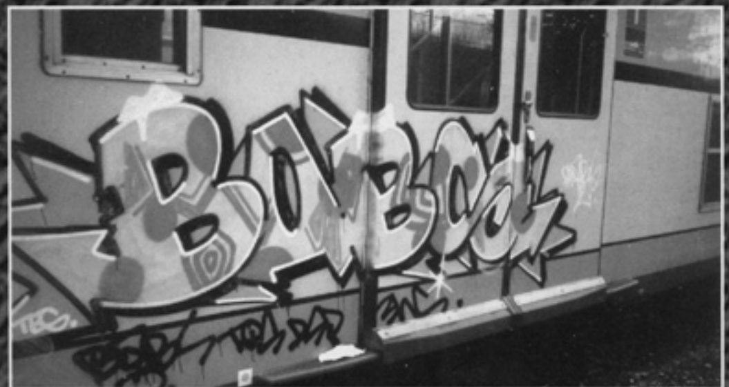
BABS / TES - DSP - 3HC (PARIS, 1993)