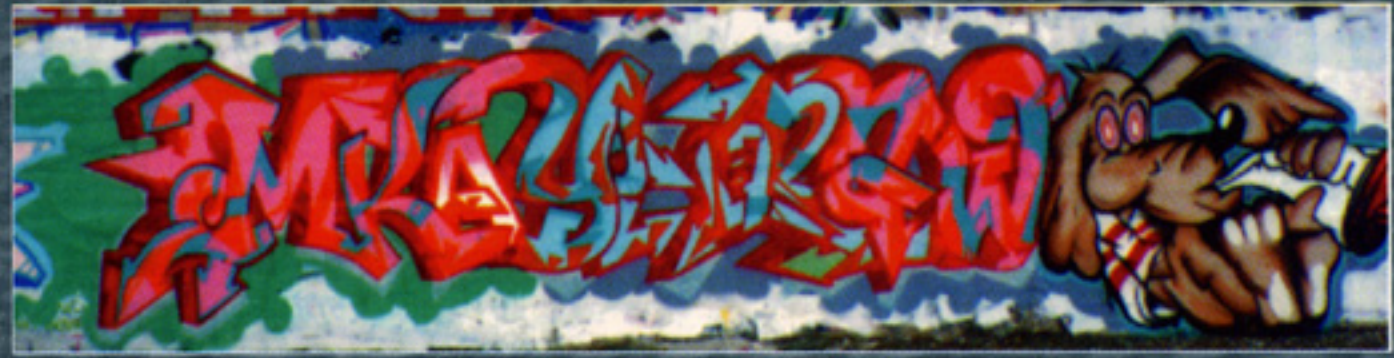
"MKAYRAW" by MKAY / COD