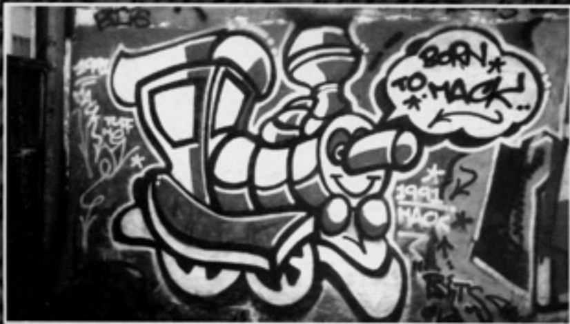
MACK (NORWAY - 1991)