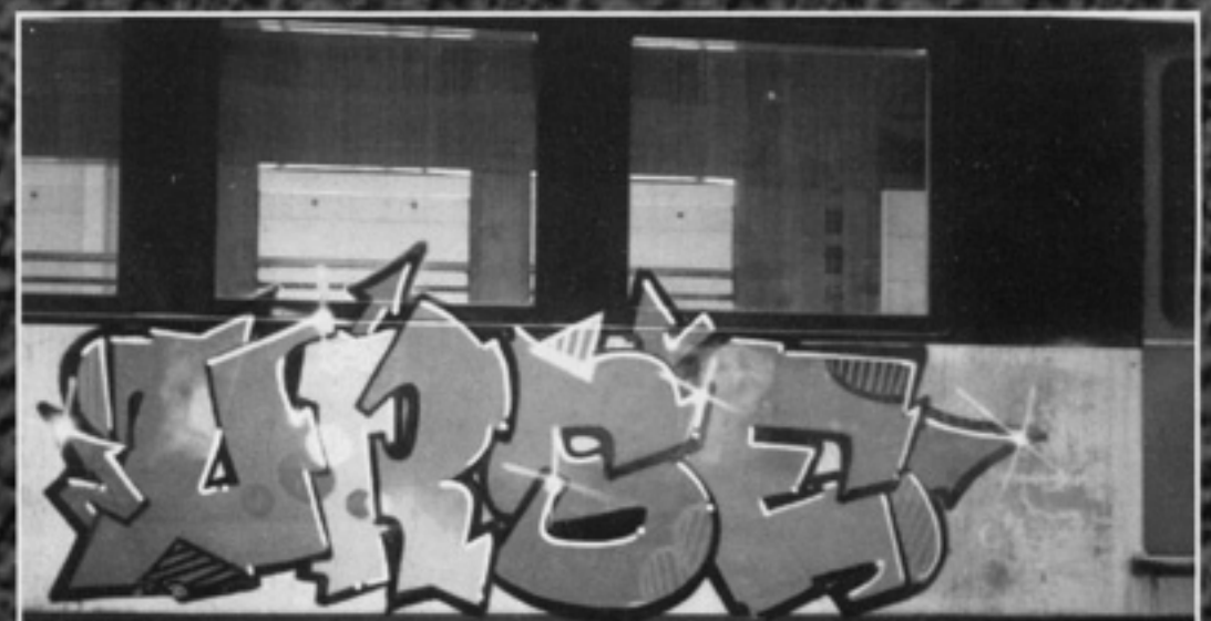
ORSE (RER A-Line, PARIS - 1993)