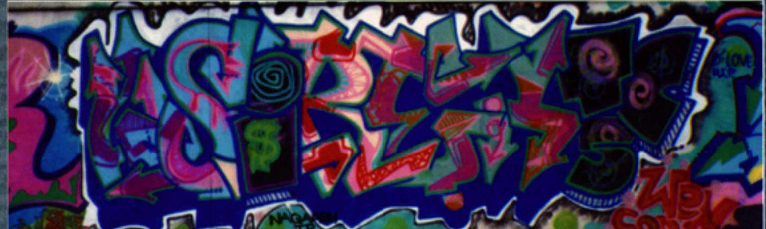
SIRE / TCS