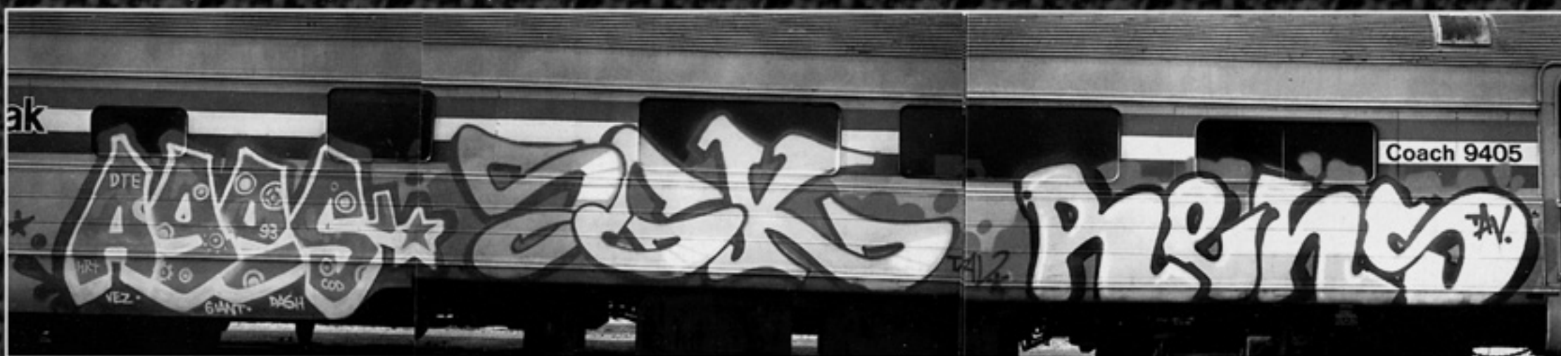
AGES / DTE - COD - HRT • with SEK 24 • RENS / TAV from COPENHAGEN (CHICAGO, USA - 1993)