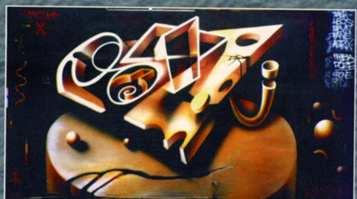
PUNCH (SIDNEY, AUSTRALIA - 1992)