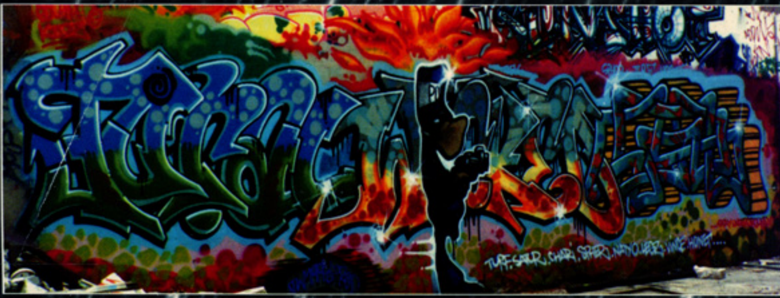
"TOTAL WICKED" by SATUR / TW • LEGZ / TW (PARIS - 1993)