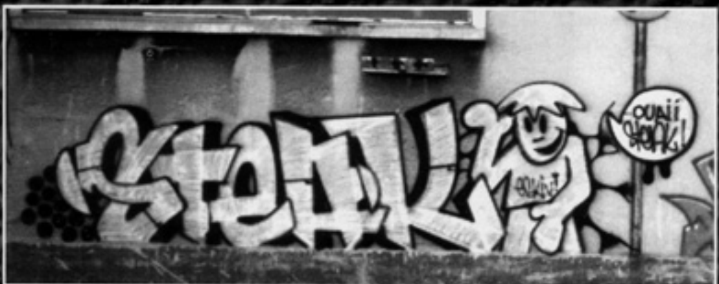
STEAK / 13 (PARIS - 1993)