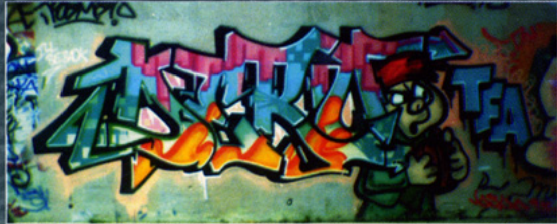
DERO / TFA (QUEENS - 1991)