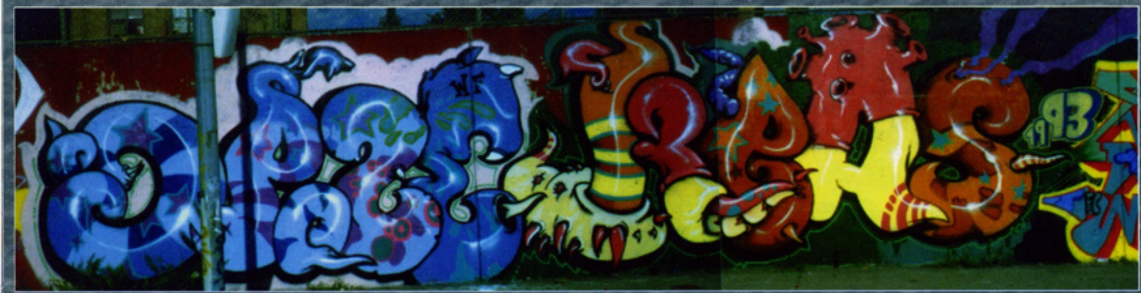
DEZE • REAS / COD (1993)