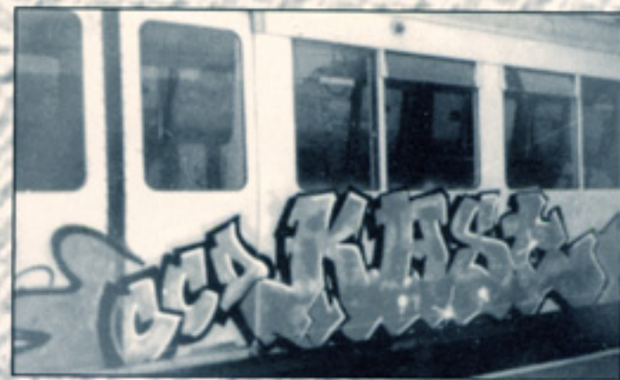
KAST / CCD (London Subway)

•1988/1989 : The later period of the 80's saw a serious decline in London's writers, reputation and style, with many of the old school kings giving up and disappearing, this left only a handful of writers with the impossible task of holding a dying scene together. West London was being controlled by the KTC crew (Koast To Coast) with Infoe,