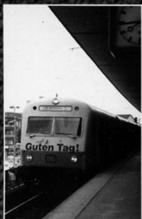
GUTEN TAG! (KÖLN, GERMANY)