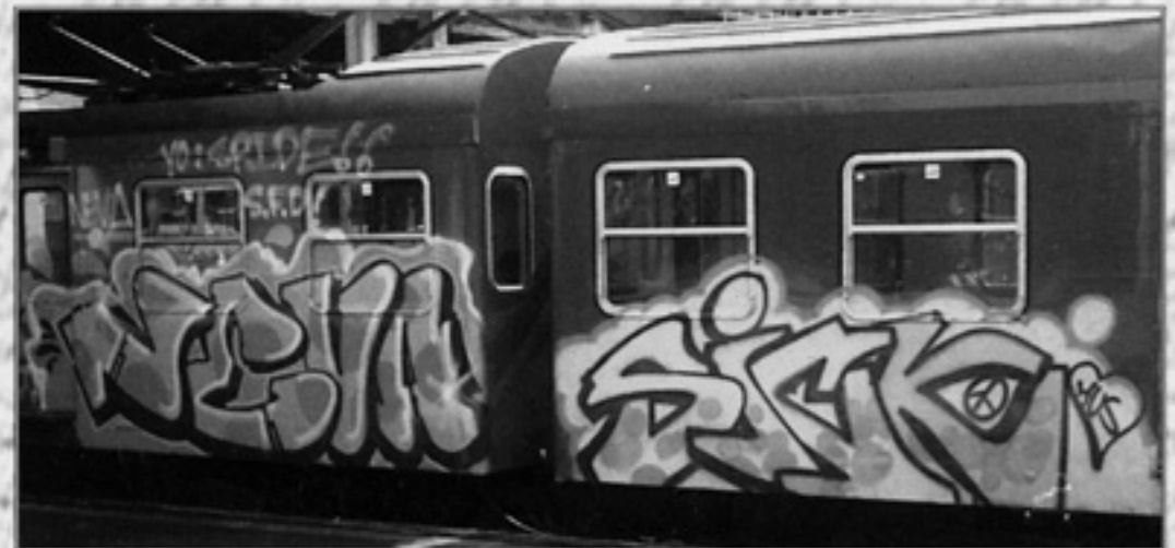
NEVA • SICK / TAV (S-Train)