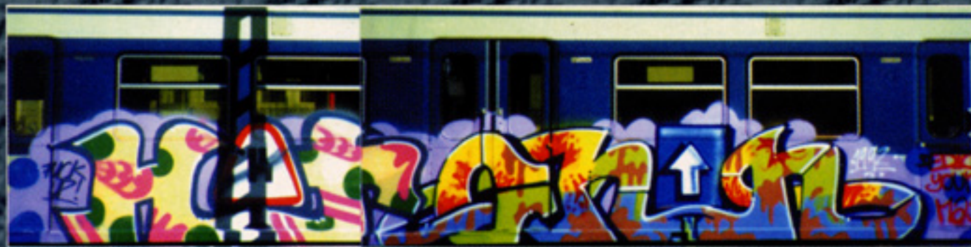
HOT • CHEN / IRA (MUNICH S-Train, GERMANY - 1992)