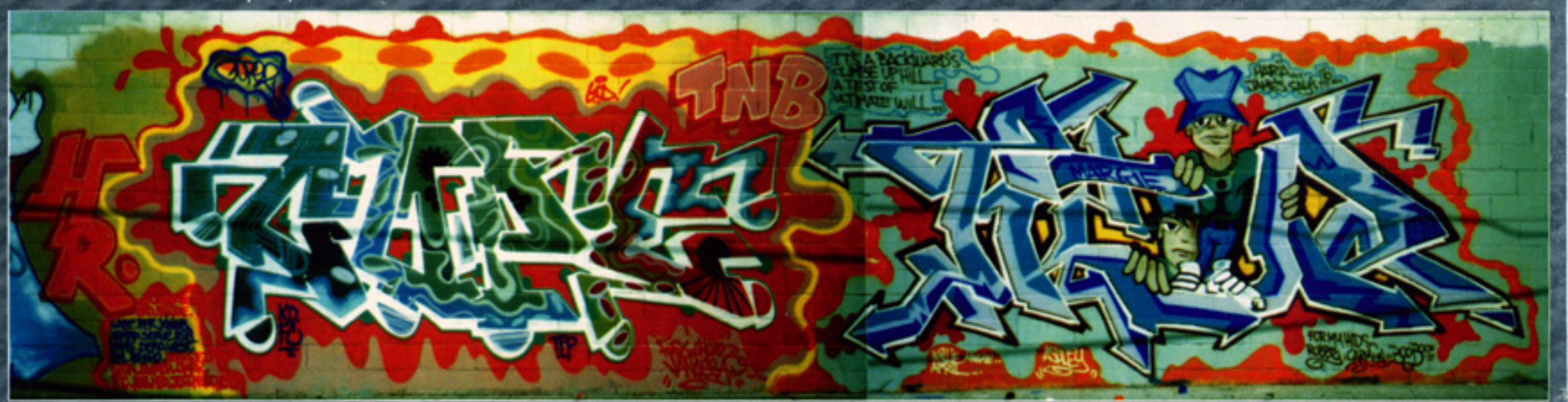
COPE 2 / TNB • T-KID / TAT (1993)