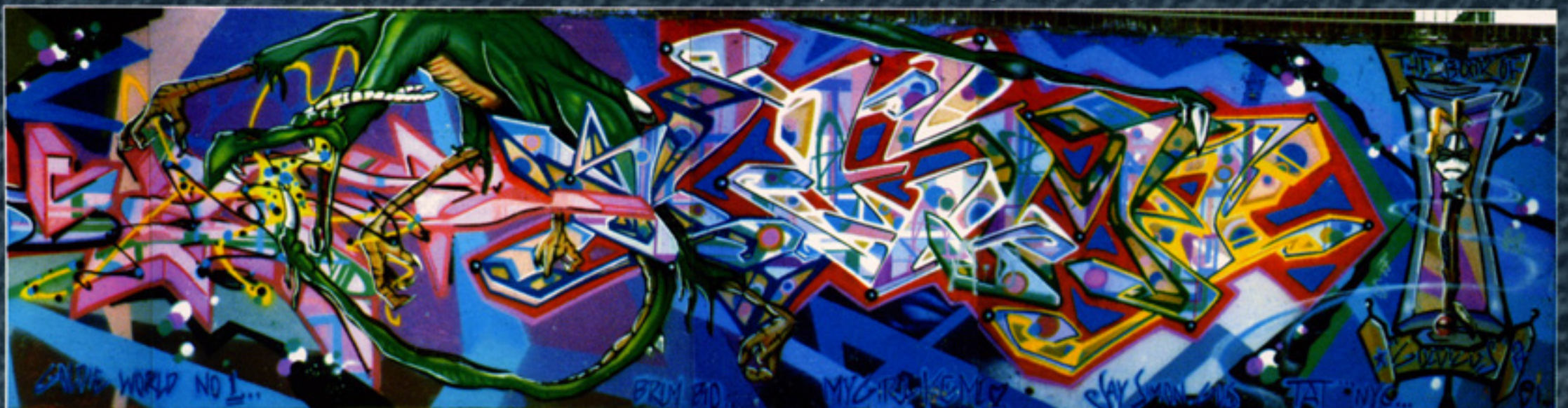
"KEMI" by GOLDIE (LONDON - 1991)