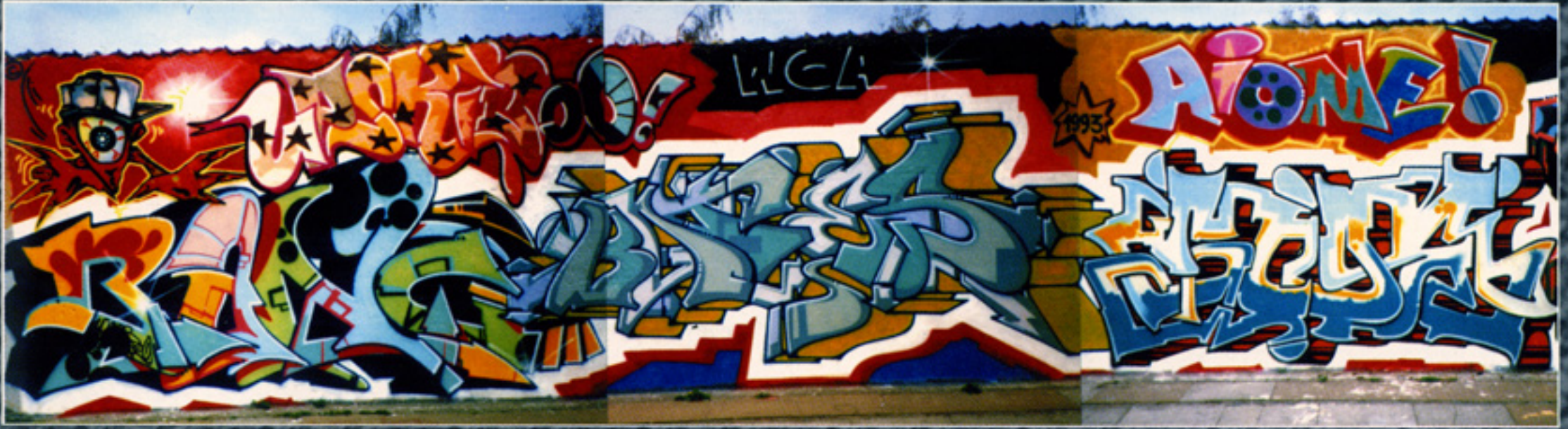
BANG / UPSKIBOO CREW • BATES / AIO - WCA • SIDE / AIO (1993) ...See live action on this wall in the "Top of the Props" video!