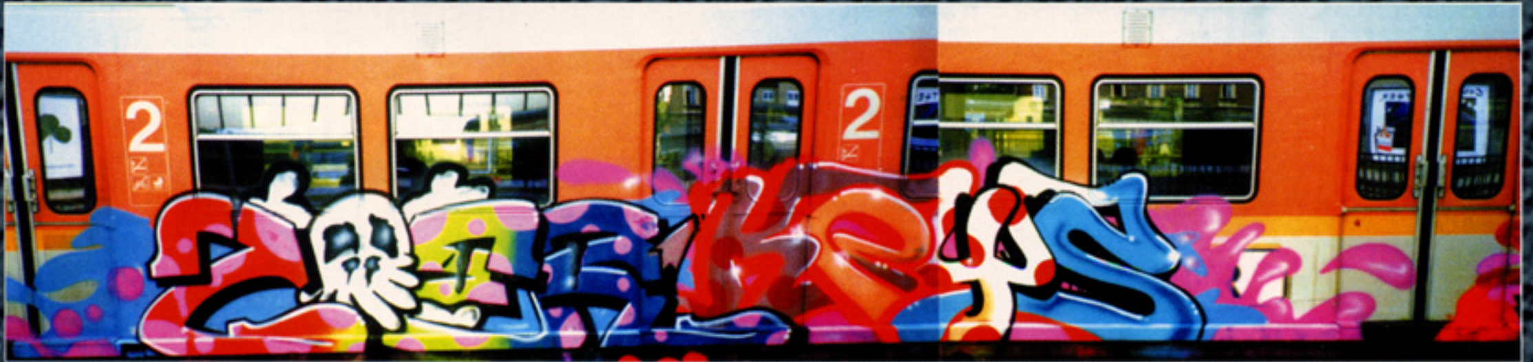
ZIER • KEYS (MUNICH S-Train, GERMANY)