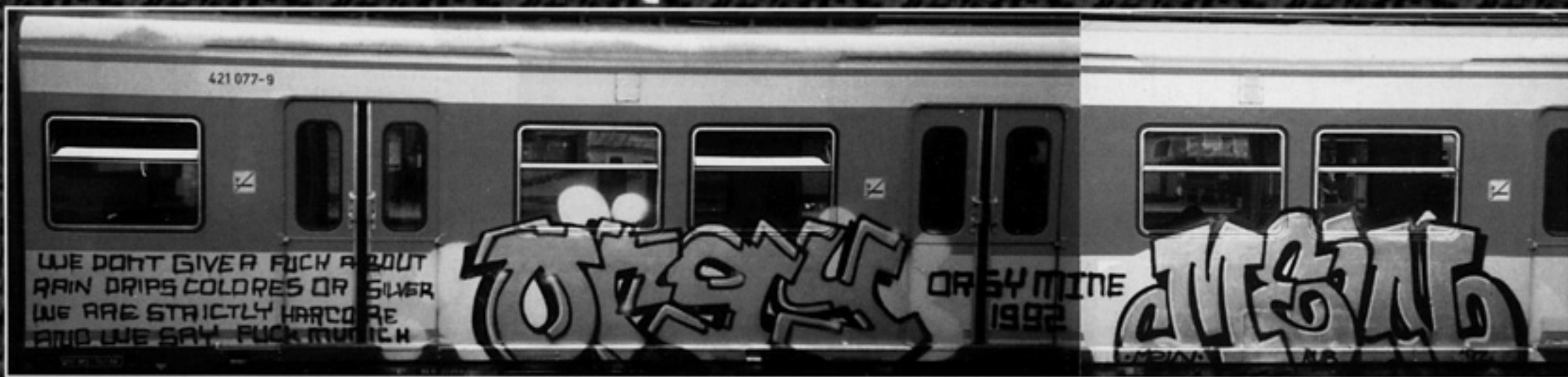
ORGY • MEIN / RVB (MUNICH S-Train, GERMANY - 1992)