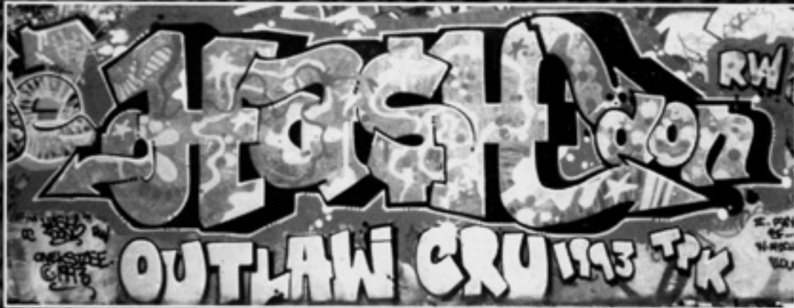
HASH DON / OC - TPK - RW (PARIS - 1993)