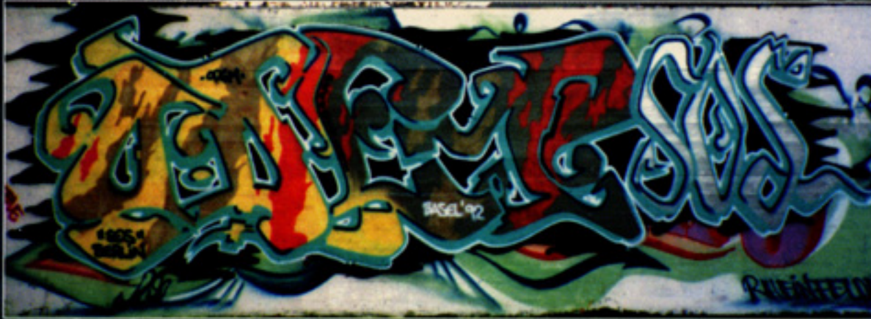
ODEM / SOS (BERLIN, GERMANY - 1993)