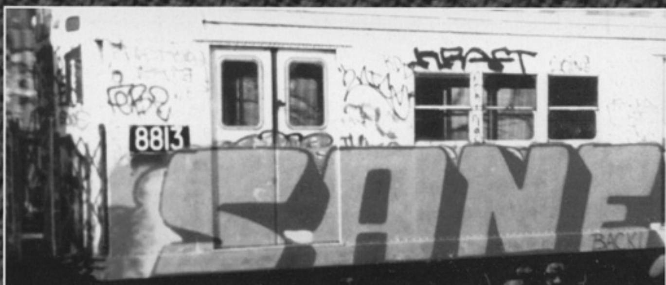
(R.I.P.) SANE / TFP (Subway)