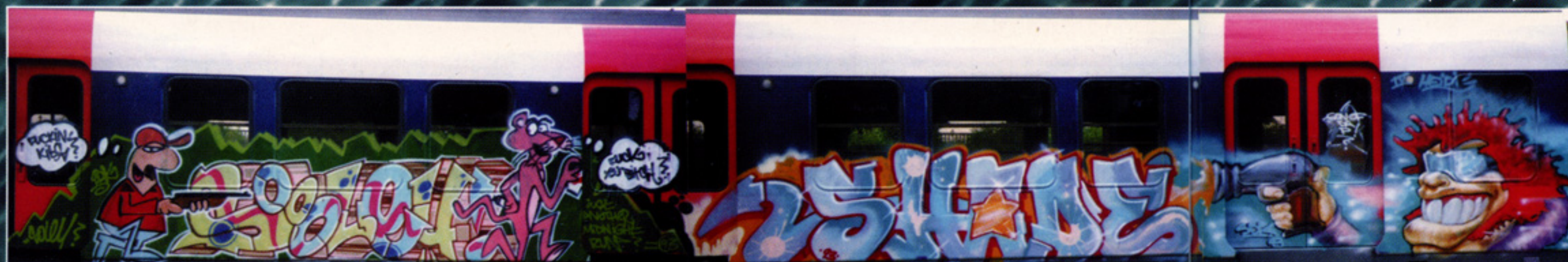
SOLEY 660 • SHADE / SDK (RER A-Line, PARIS - 1993)