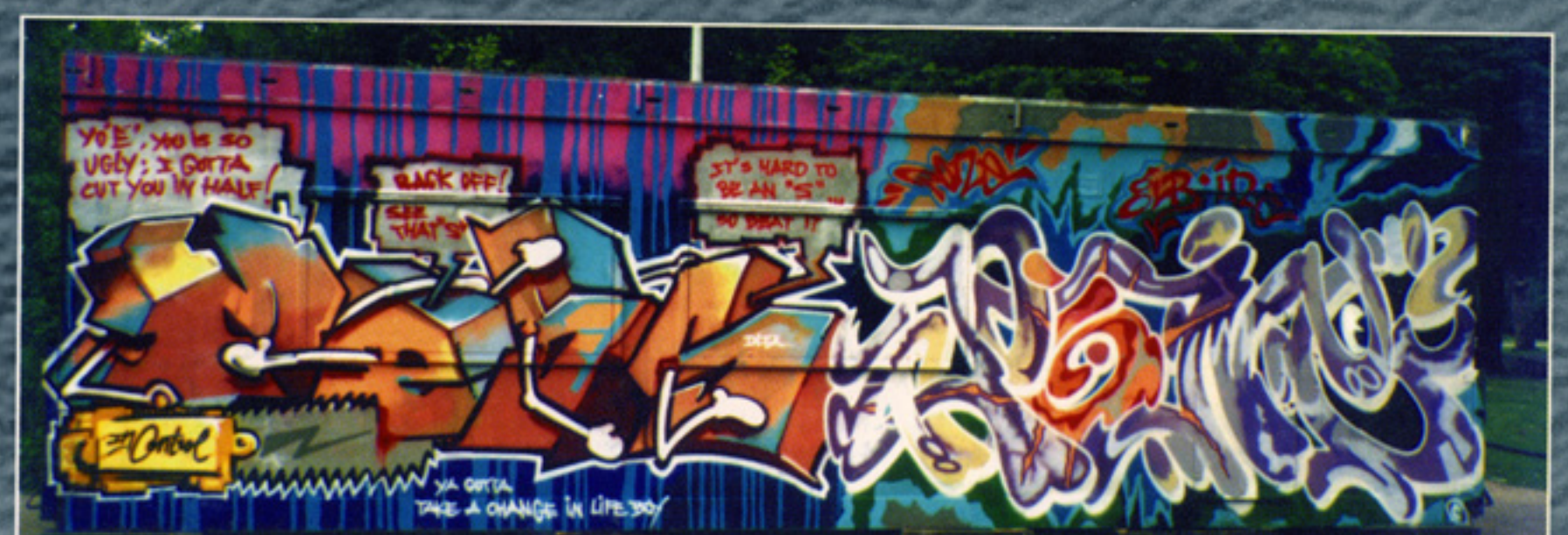
MESS by DELTA / INC • PONE / GVB - INC (HOLLAND, 1993)