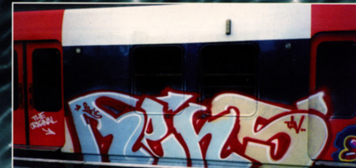
RENS / TAV from COPENHAGEN (RER A-Line, PARIS - 1993)