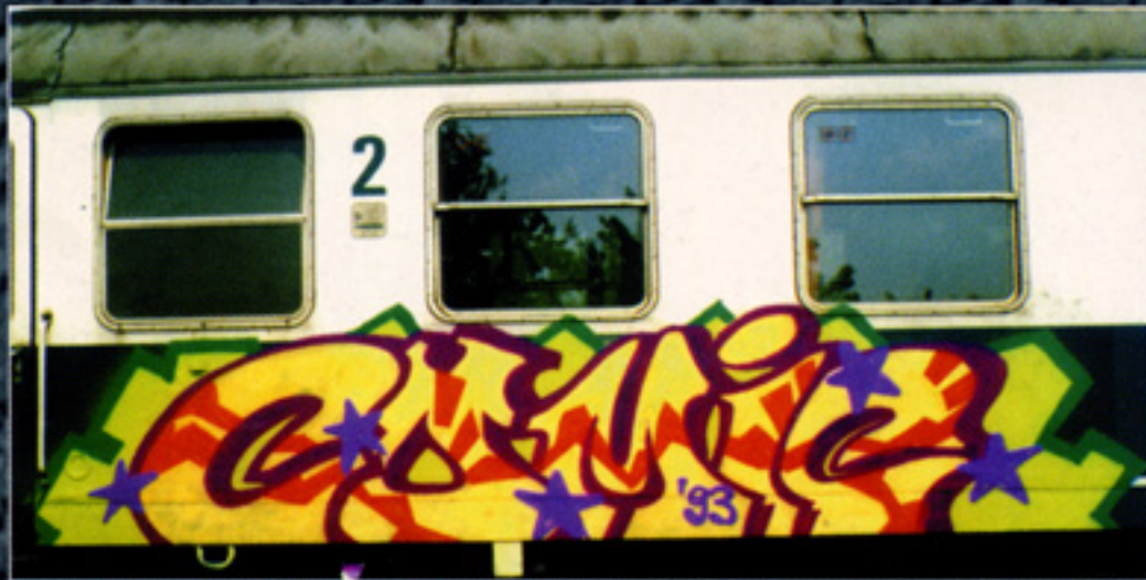
COMIC (HAMBURG, GERMANY - 1993)