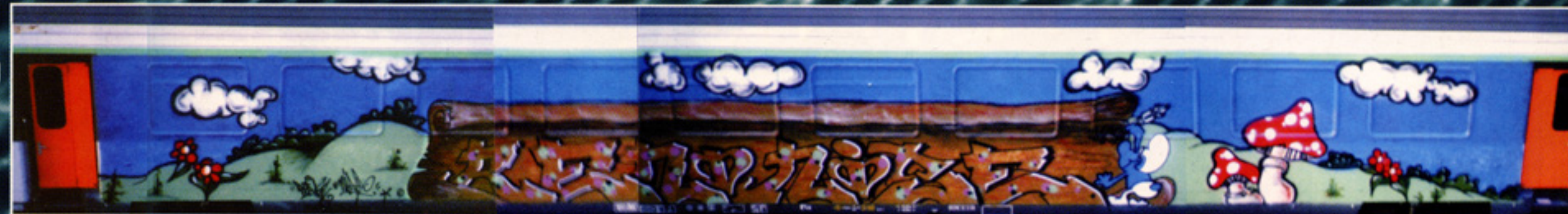
Whole Car by RENC • NISE / MCS (PARIS - 1993)