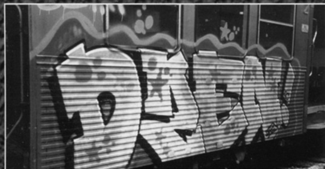
DZEN / OC (PARIS - 1992)