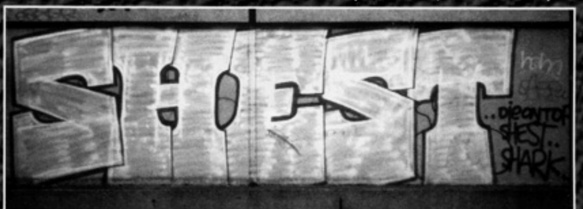
SHEST / DIE ON TOP (PARIS - 1991)