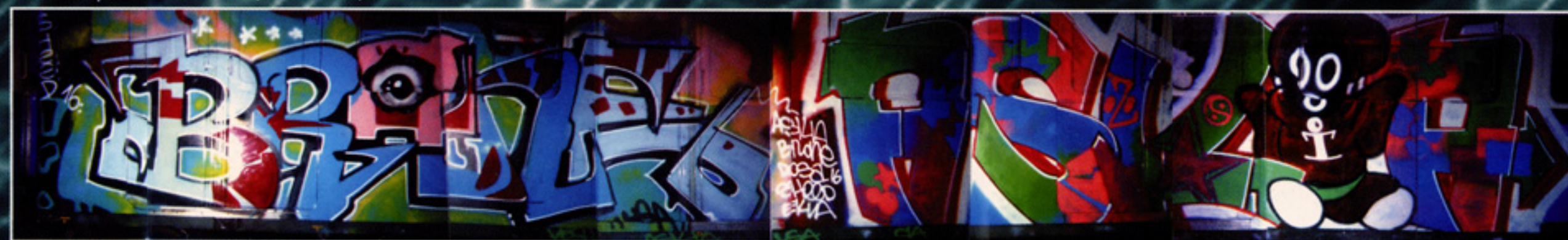
Whole Car by BROE / USA - TW • ASKIA / USA (Subway, PARIS - 1993)