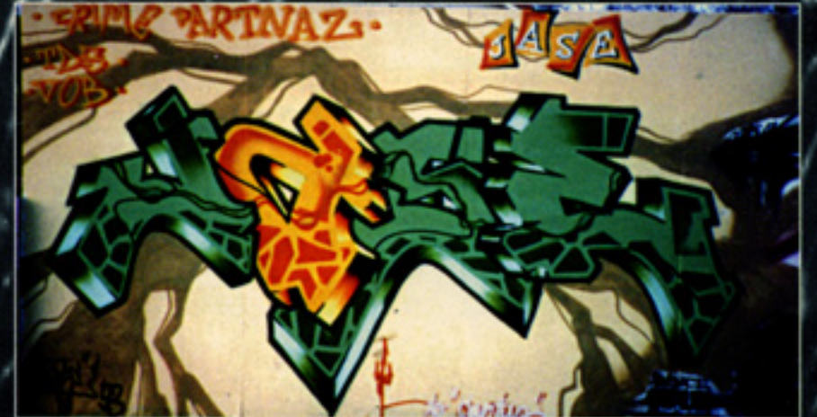
JASE / TDS - VOB (HAMBURG, GERMANY - 1993)