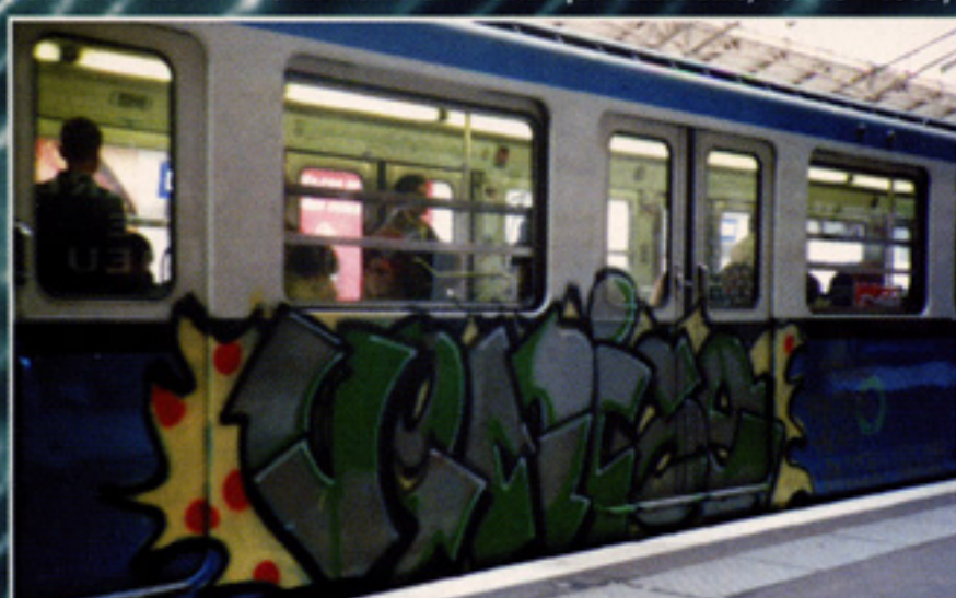
VENISE / USA (Subway, PARIS - 1993)