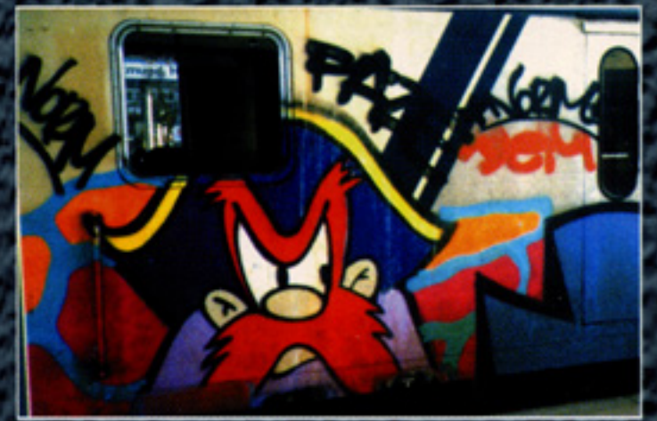
DAR (DORTMUND, GERMANY - 1993)