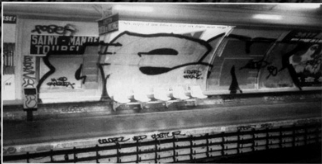
OEN / VEP (PARIS Subway Station - 1991)