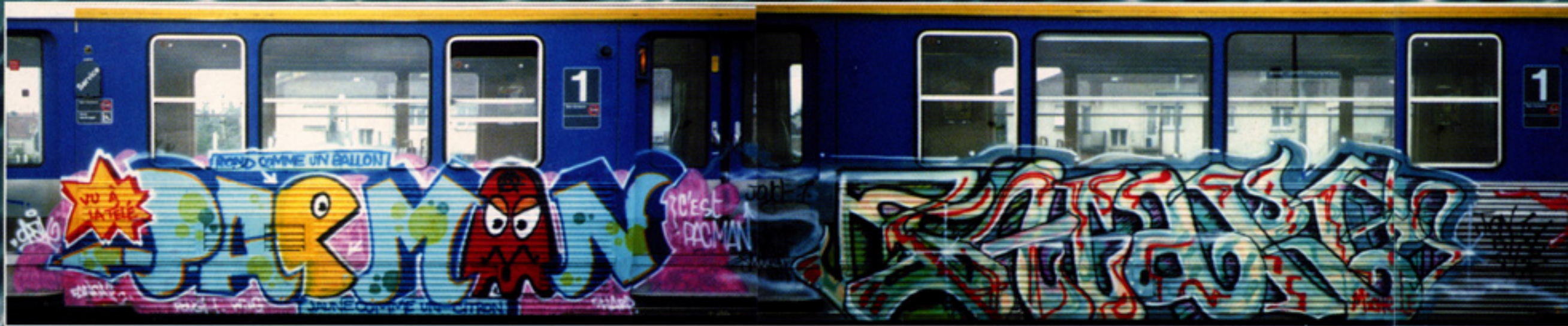
PACMAN / SDK • SHARP from NEW YORK (St Lazare Line, PARIS - 1993)