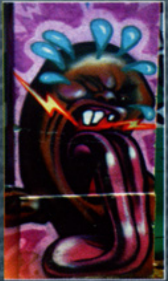
RELM / COD