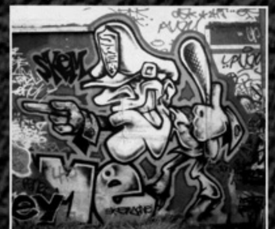
SKEM (AMSTERDAM, HOLLAND - 1991)