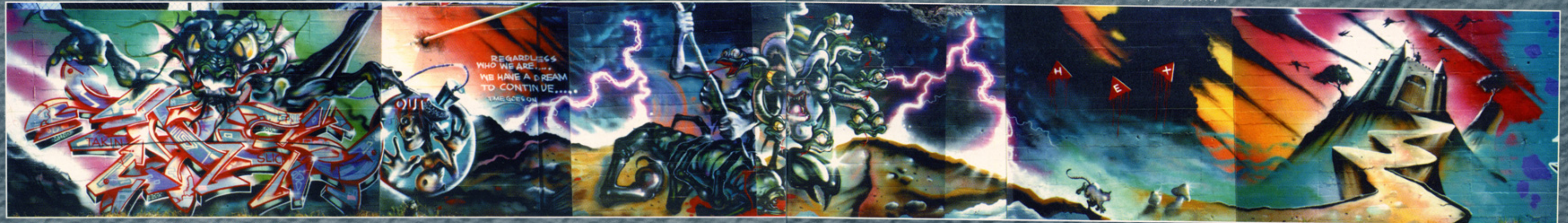
HEX / TGO (Left part of the HEX battle vs SLICK - LOS ANGELES, USA - 1991)