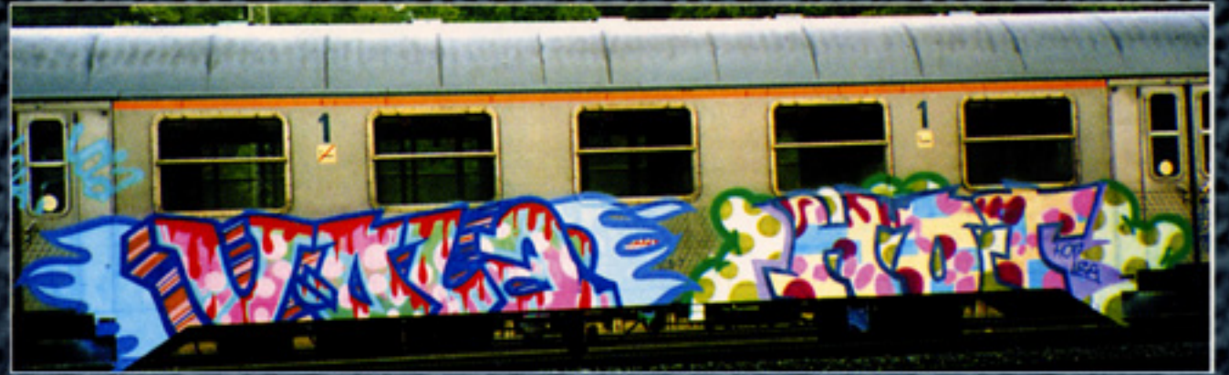
VOLA • HOT / IRA (GERMANY)