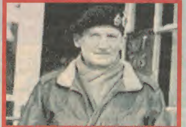
NEWSREEL... war hero Monty

ABOVE is your map of the game. You can play as either the Germans or the Allies. Divisions are marked with one of four icons, signalling attack mode, defence, mobile and shattered.